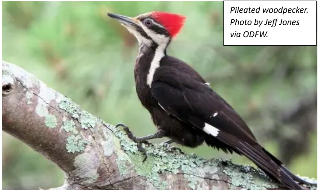
Pileated woodpecker.

Researchers at Cornell University tracked the movement of EAB from Detroit and around the Great Lakes and the impact on bird populations using a citizen scientist database, the Project Feeder Watch. They found an increase in numbers for three woodpecker species and the white-breasted nuthatch, important bark-foraging birds in that region.