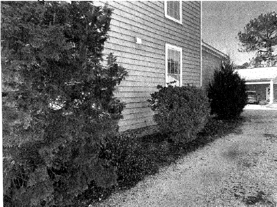
214 Walnut Street