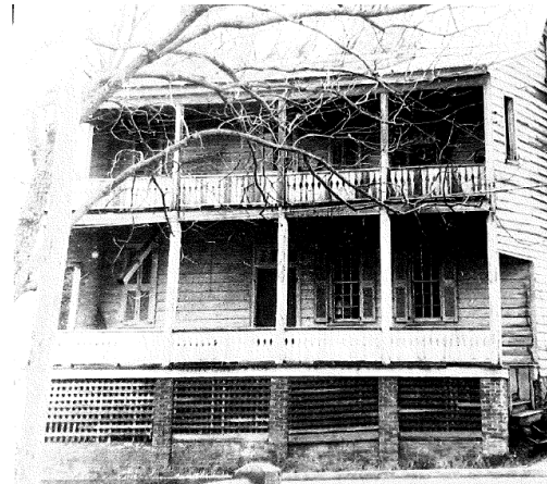
224 Water Street