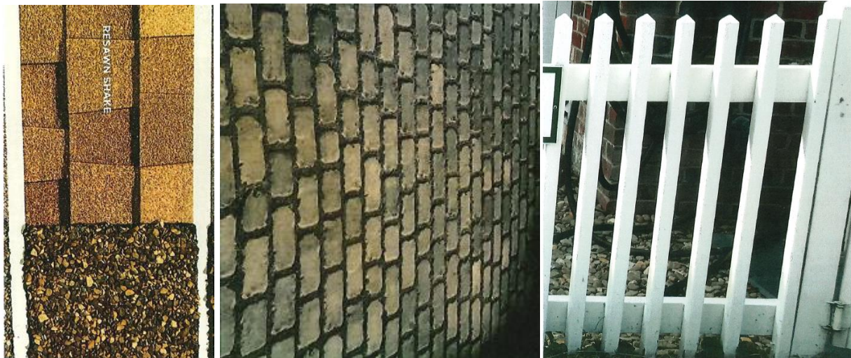
224 Water Street