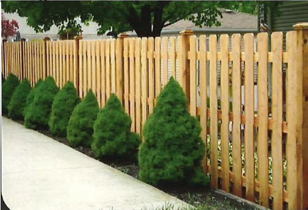
209 Water Street