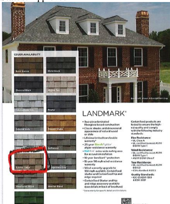
209 Water Street