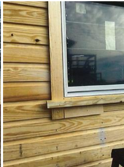
209 Water Street