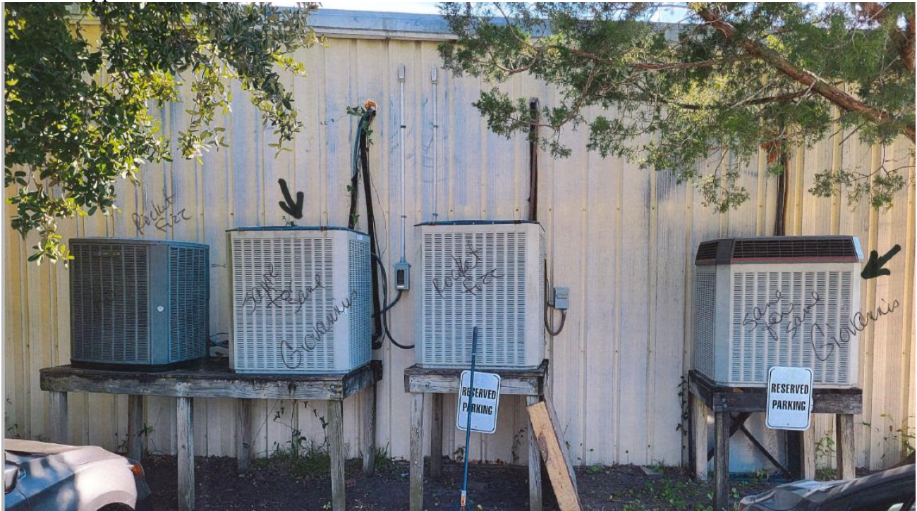
101 Church Street

Date: January 8, 2024 Applicant: Melissa Anderson Address: 101 Church Street Action: Install new HVAC units. Status: Approved