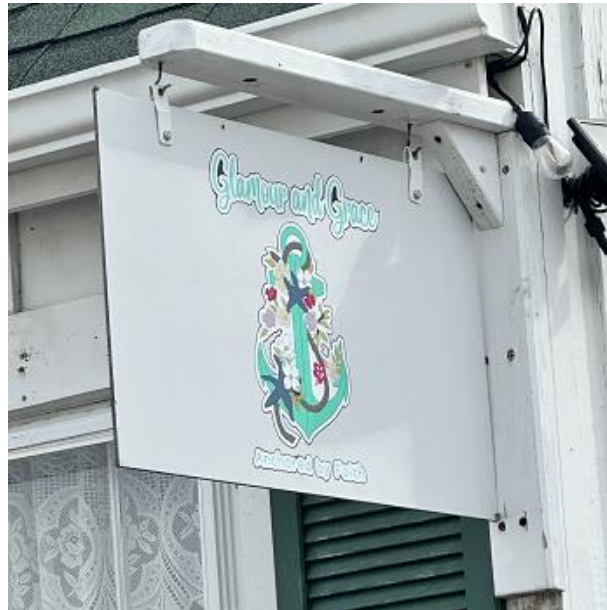
105 N Front Street