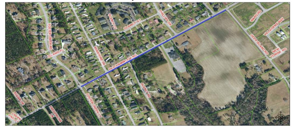
Section 2 of Priority 2