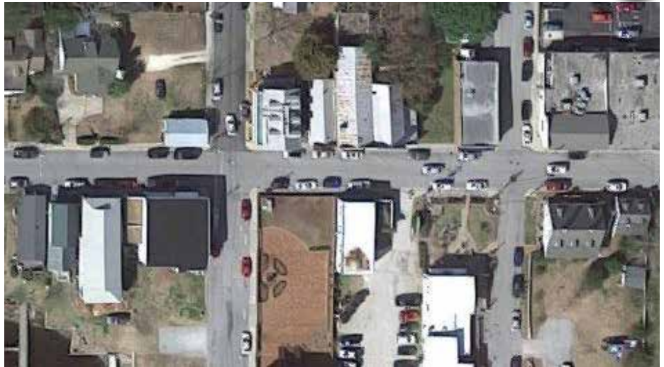
Example of Traditional Town Center (TTC)

Buildings are “human-scaled,” meaning not more than three stories tall, but also should be a minimum of two stories to create a street presence.