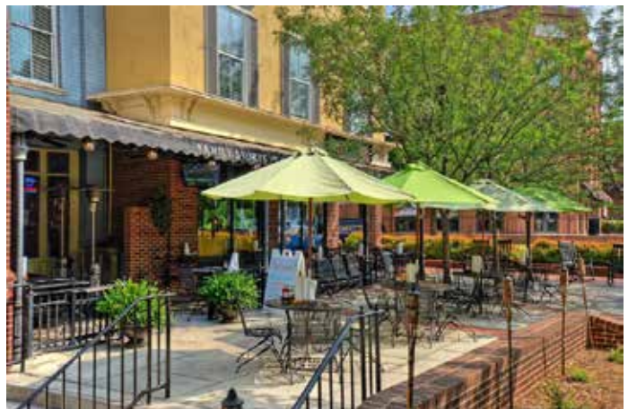
Example of downtown development.