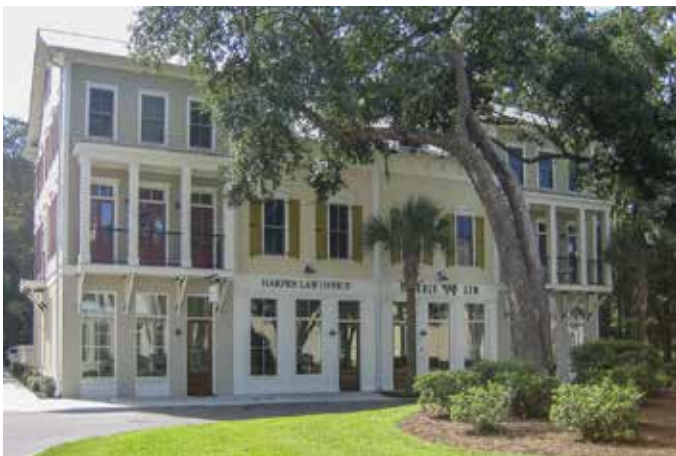
Example of downtown development.