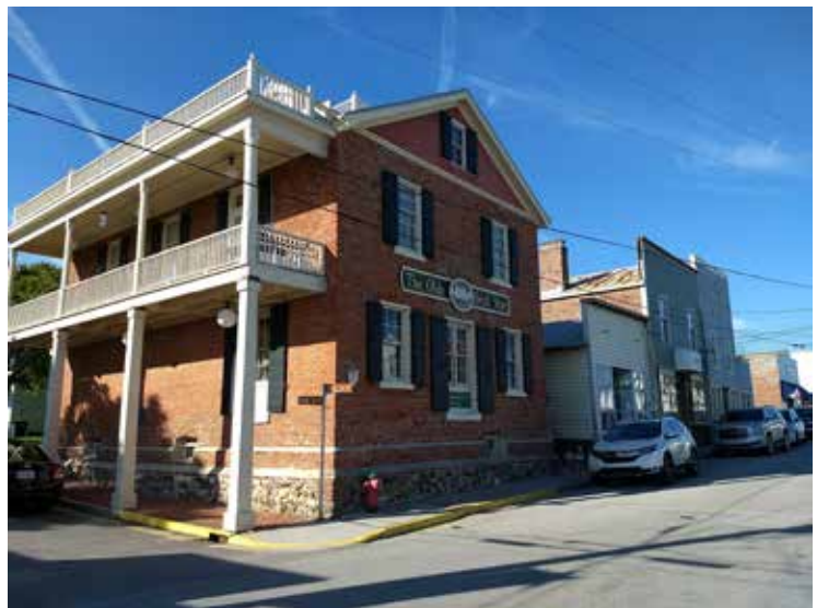
Historic downtown Swansboro

The rights-of-way within these districts may be narrower than typical local streets of Swansboro with two-way traffic and on-street parking but will not be as narrow as those in the historic downtown. These roads are meant to handle slow speed traffic and serve a similar purpose as a parking aisle so that people can park-and-walk to their destinations. Sidewalks flank the roads and buildings built up to or within a few feet of the right-of-way line.