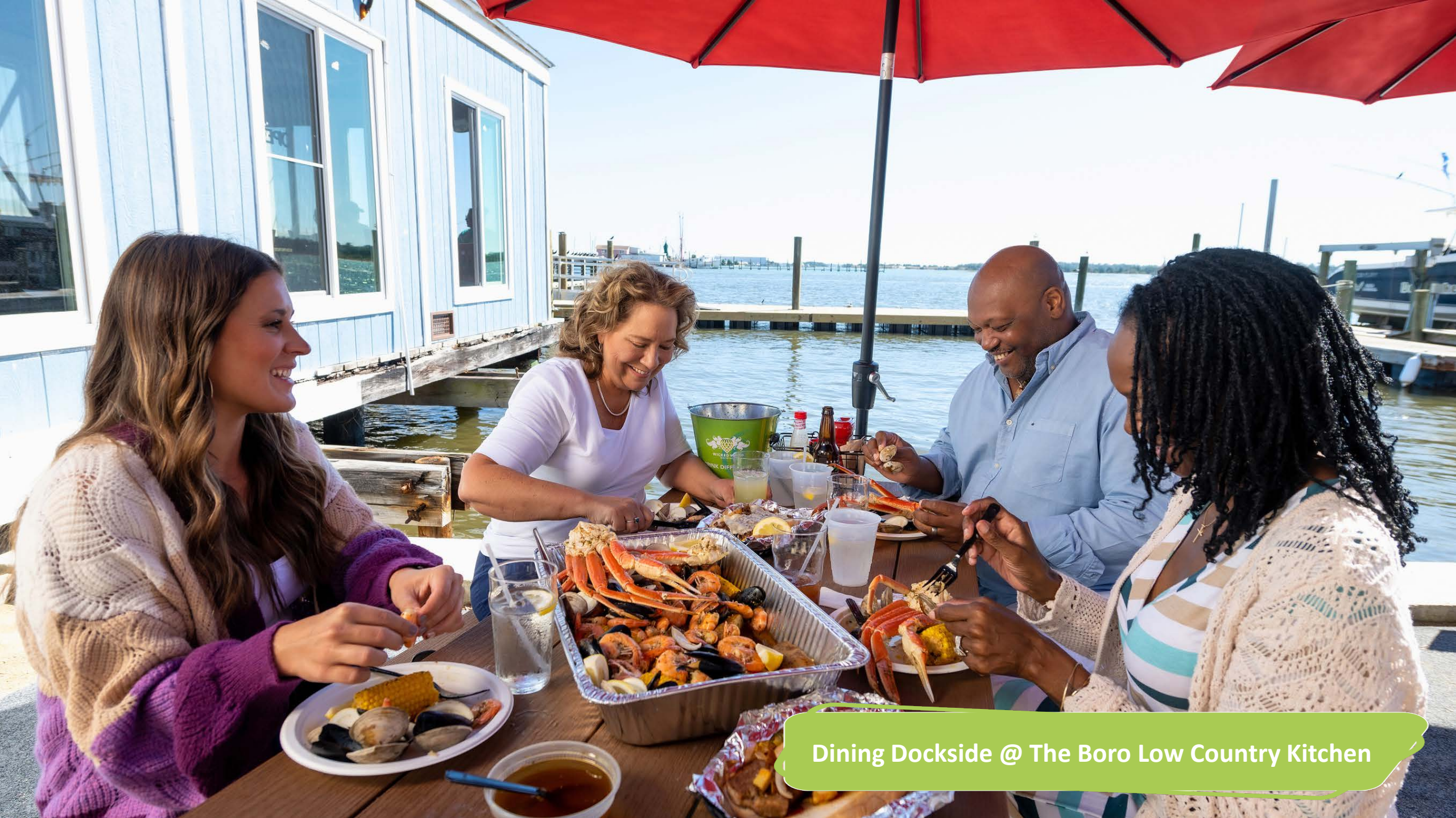
Dining Dockside @ The Boro Low Country Kitchen