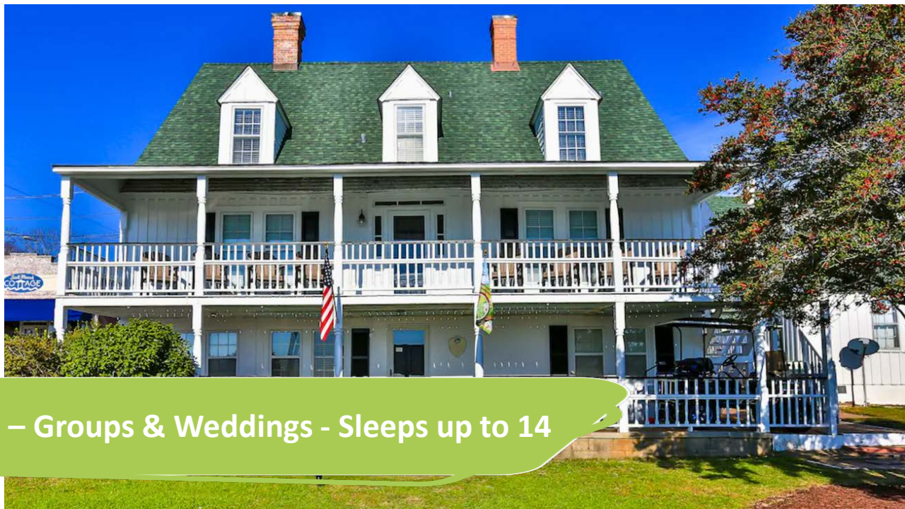
Downtown Swansboro's Mattocks House – Groups & Weddings - Sleeps up to 14