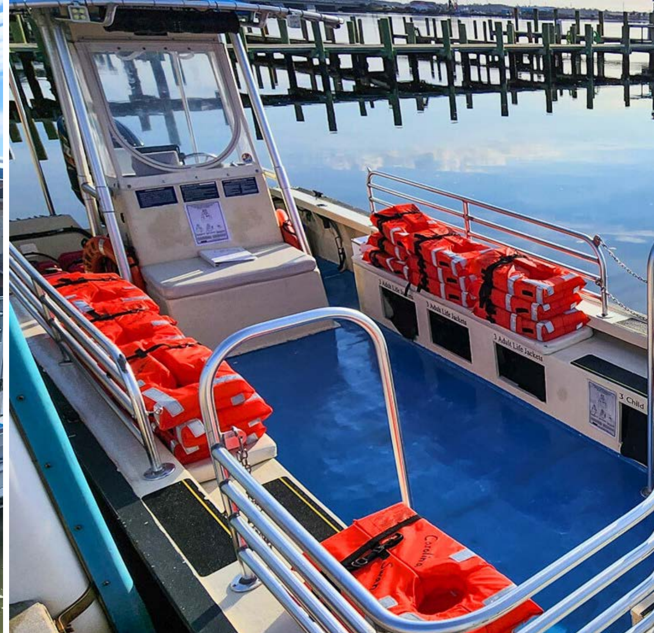
Lady Swan Boat Tours Fleet – Large Group Cruises and Adventures aboard the Carolina Swan