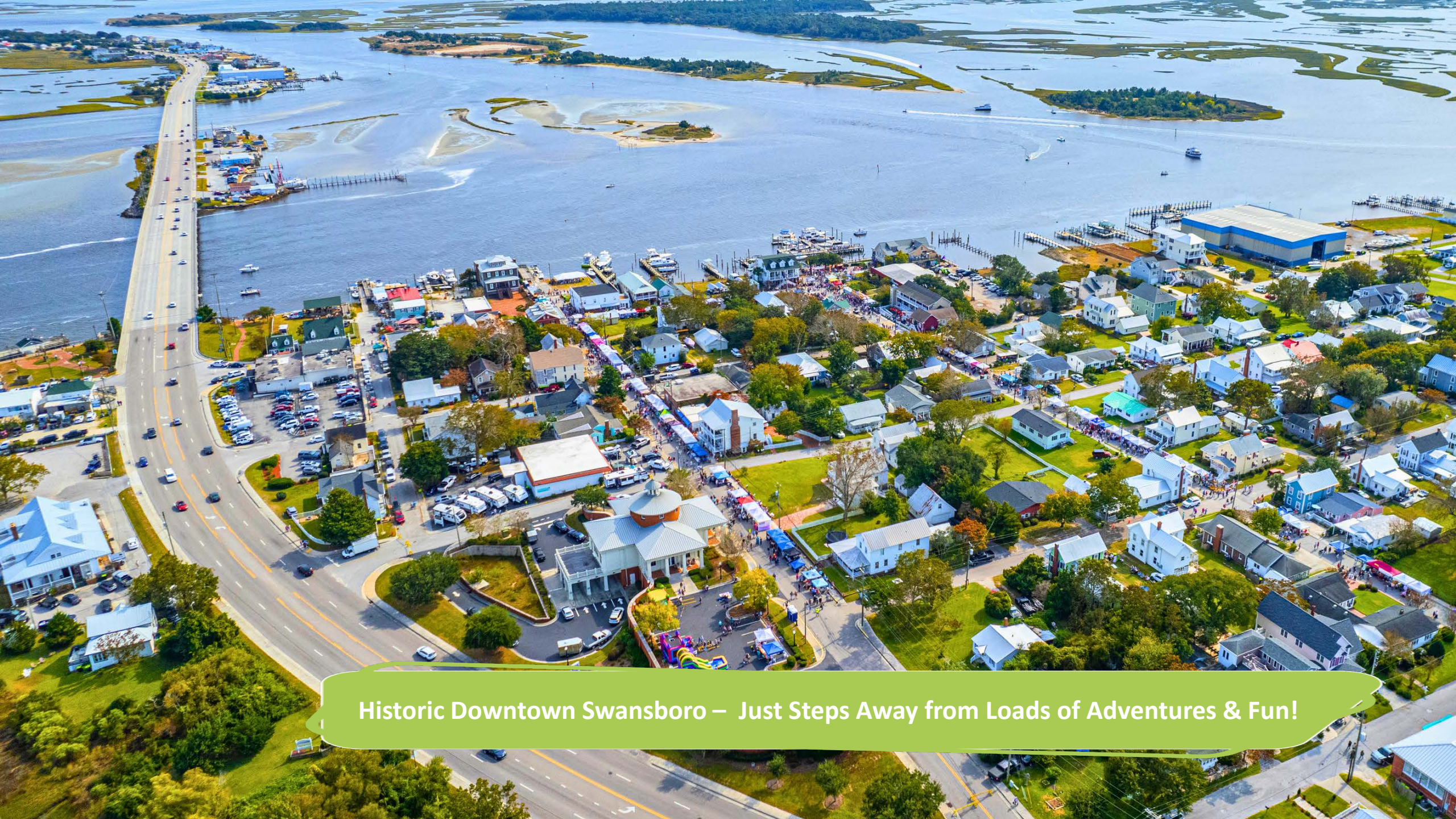
Historic Downtown Swansboro – Just Steps Away from Loads of Adventures & Fun!