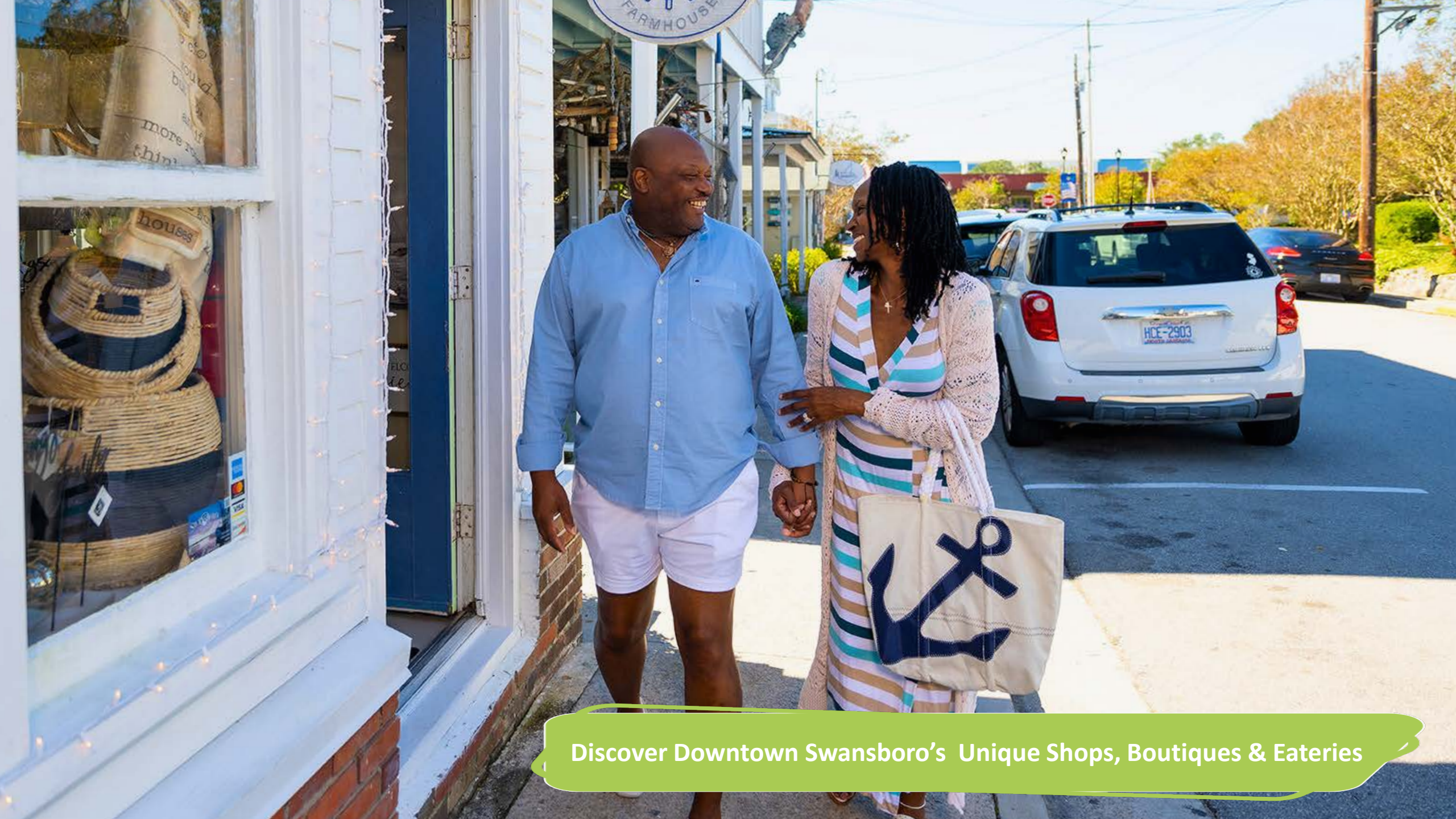
Discover Downtown Swansboro's Unique Shops, Boutiques & Eateries