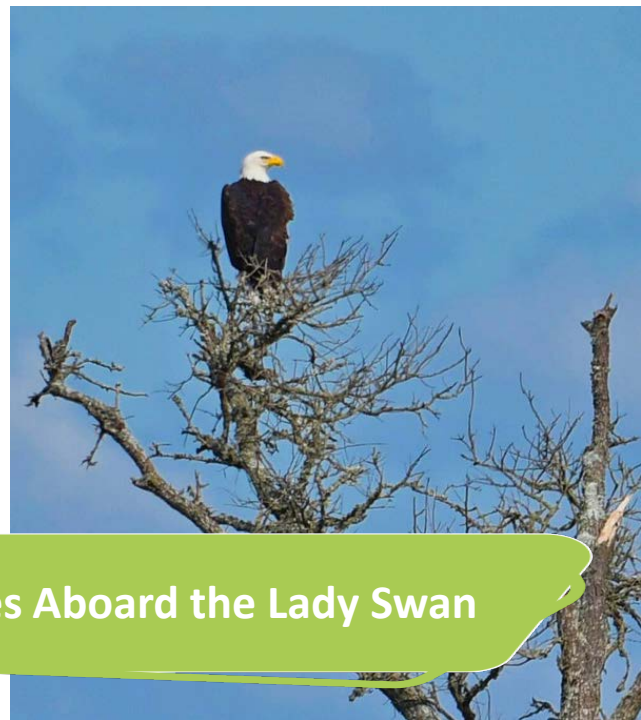
Swansboro Birding Cruises Aboard the Lady Swan