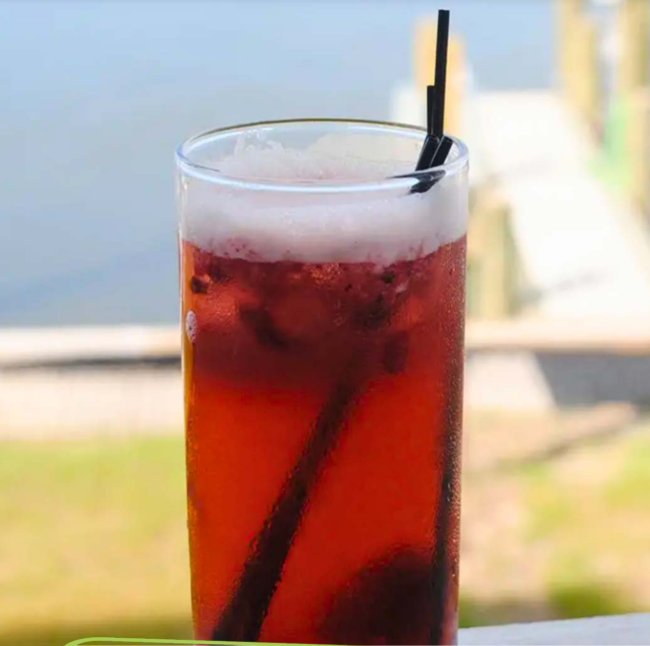
Mocktails Overlooking White Oak River at il Cigno Italiano Ristorante