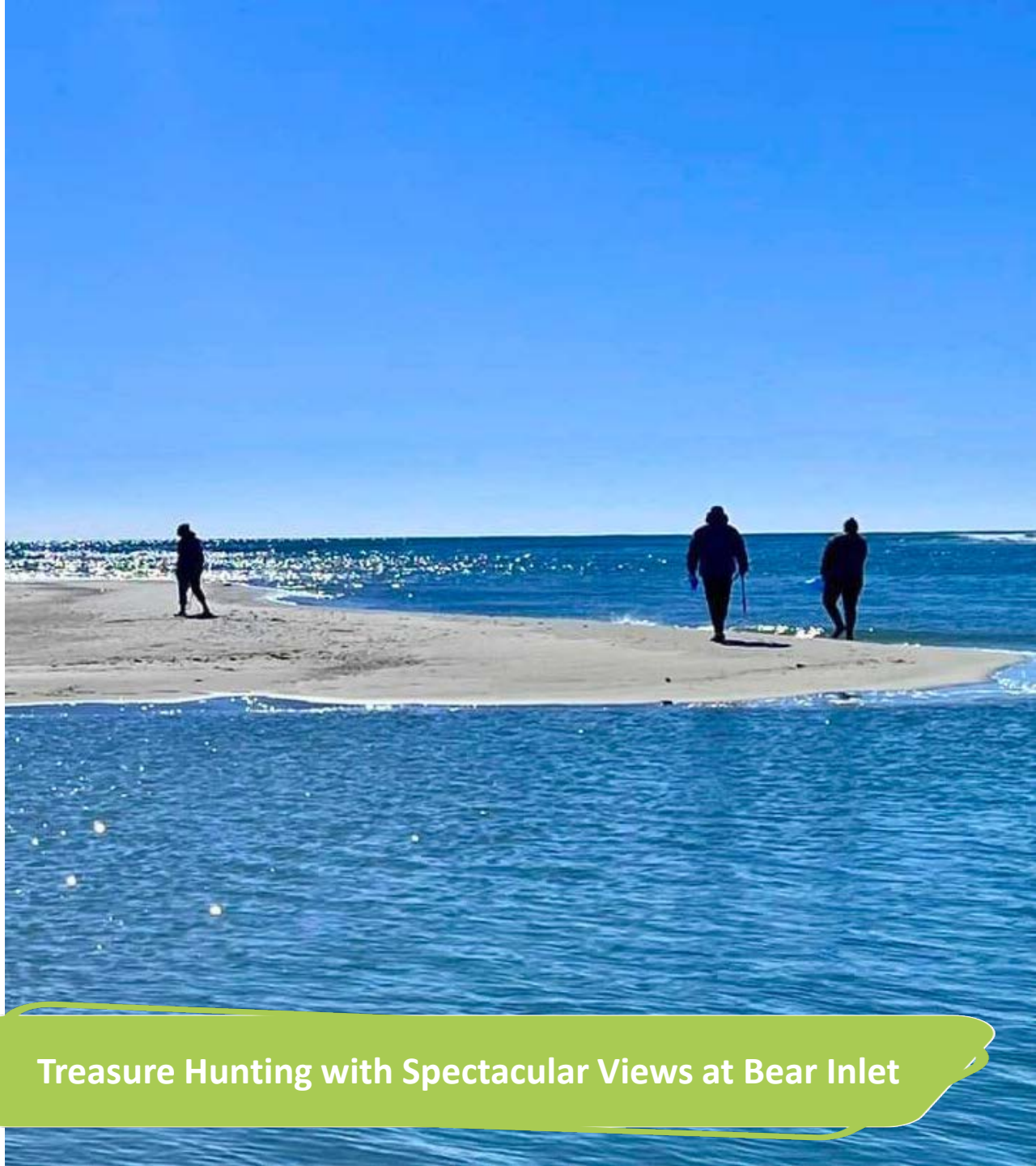
Treasure Hunting with Spectacular Views at Bear Inlet