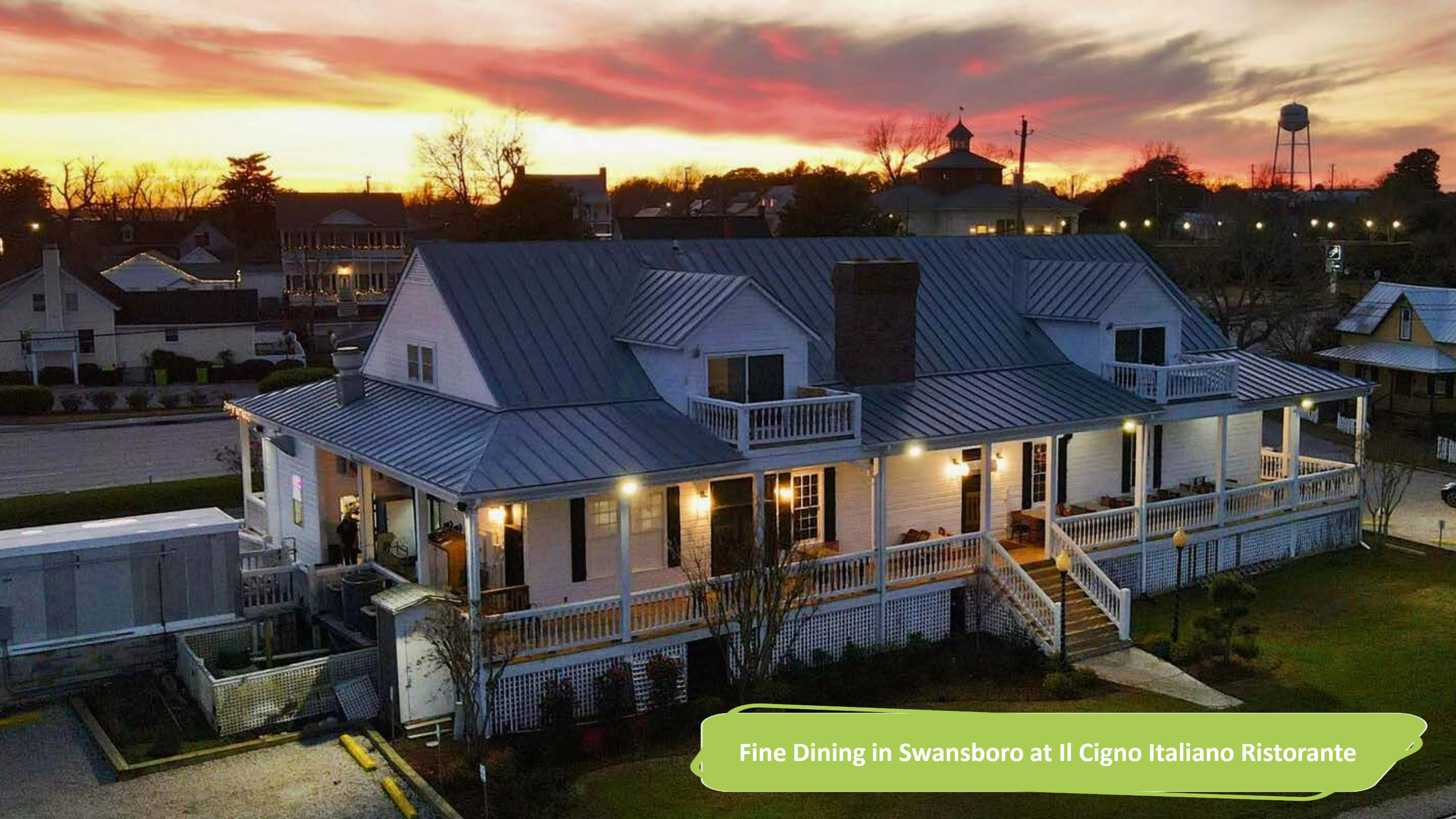
Fine Dining in Swansboro at Il Cigno Italiano Ristorante