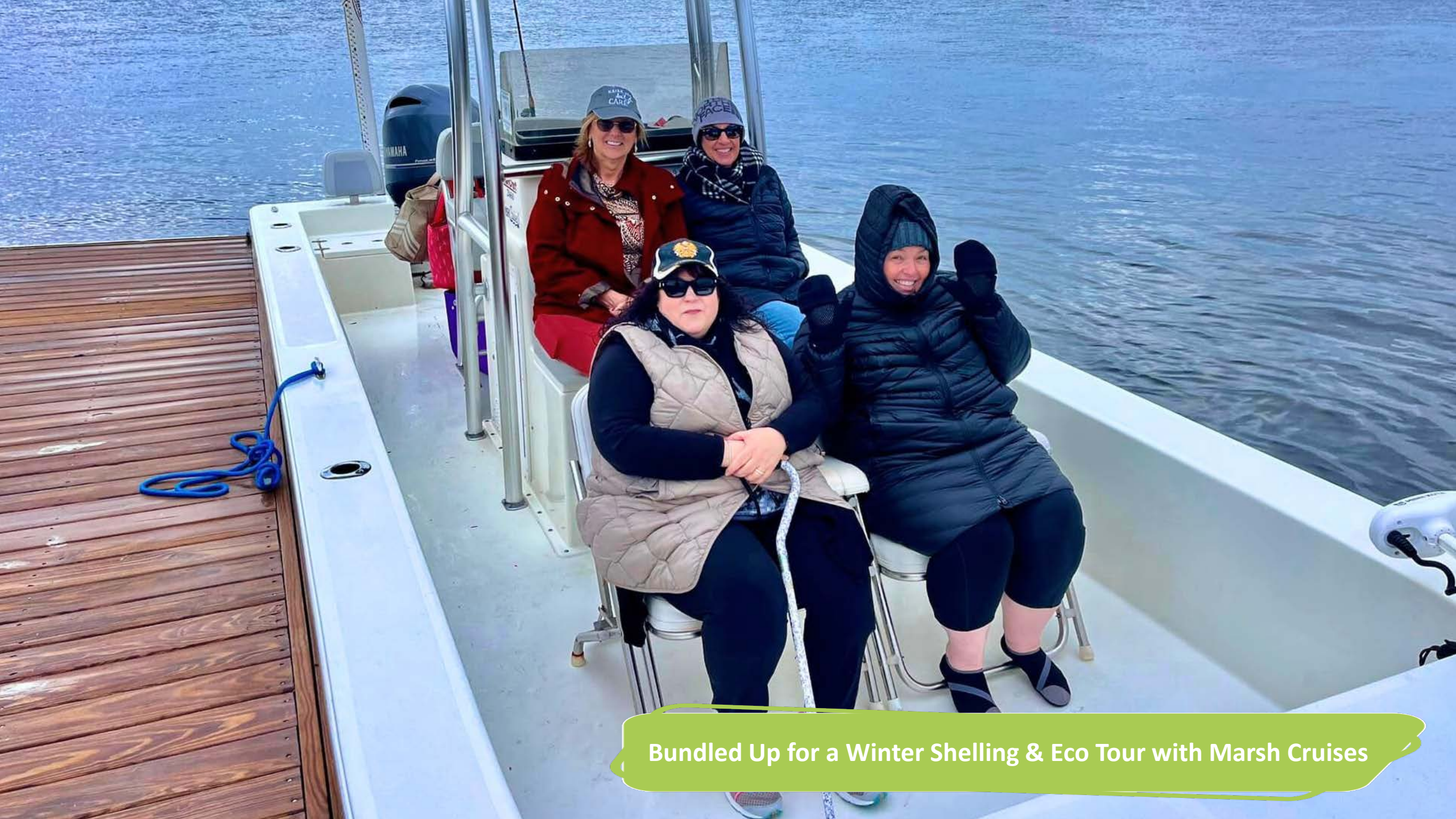
Bundled Up for a Winter Shelling & Eco Tour with Marsh Cruises