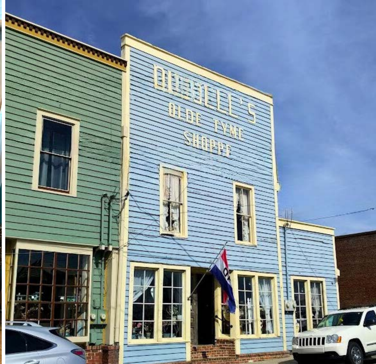
Boro Girl Boutique located in the old Russell's Building – Hand Painted Furniture & Local Artist Works