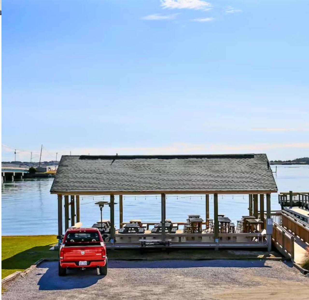
Swansboro's New Accommodation - Mattocks House & Event Pavilion