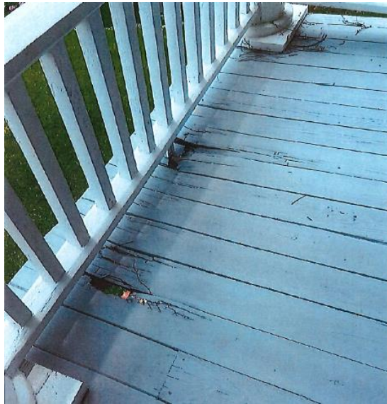
114 Elm Street