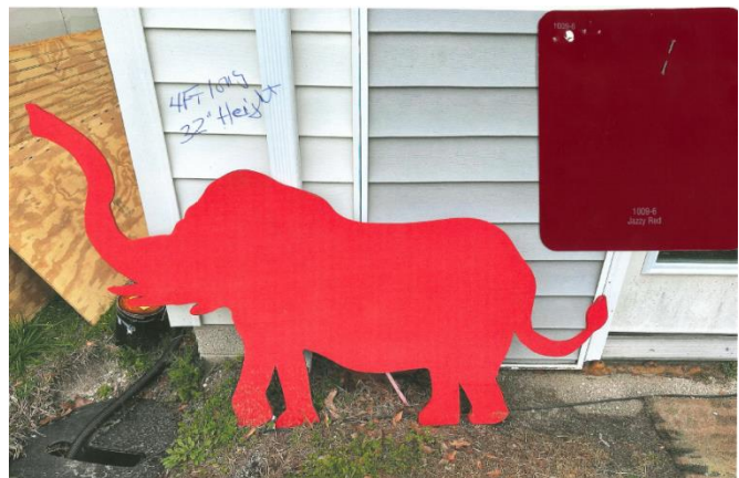
129-2 Front Street