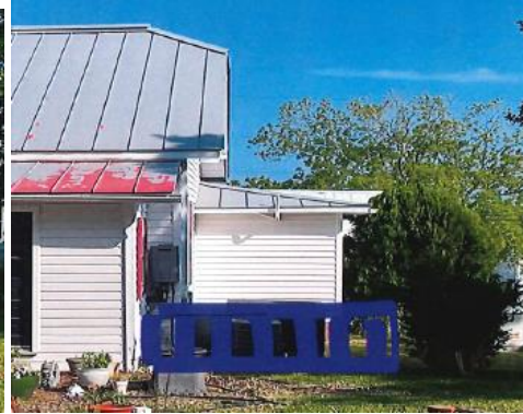
212 Elm Street