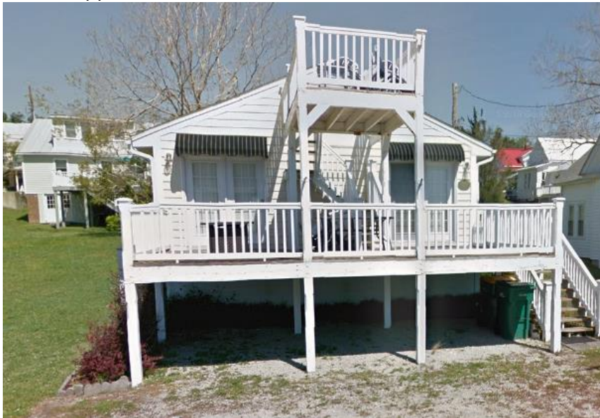
216 Water Street