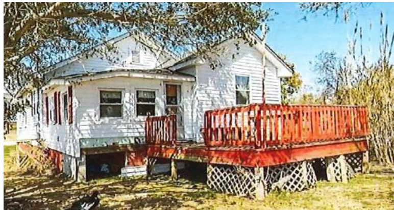
209 Water Street