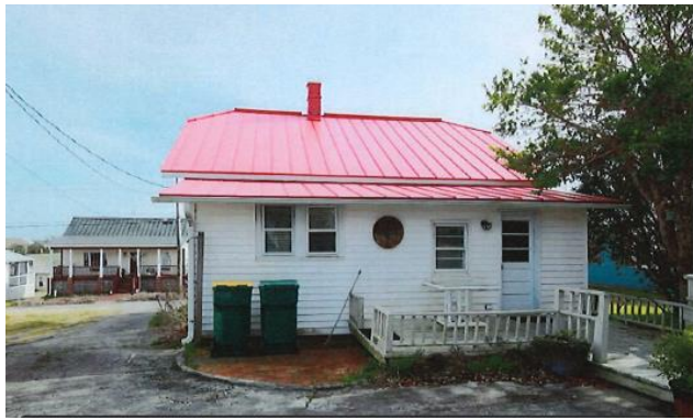
212 Elm Street