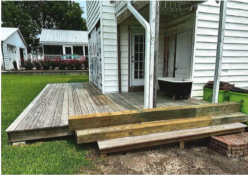
108 S Walnut Street