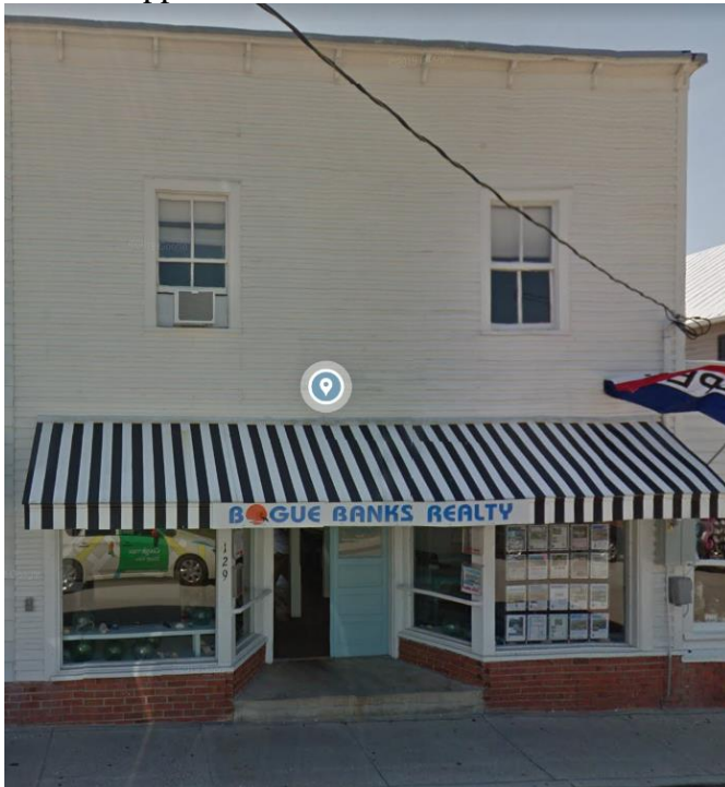
129 Front Street Unit 1