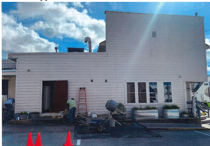
106 Front Street