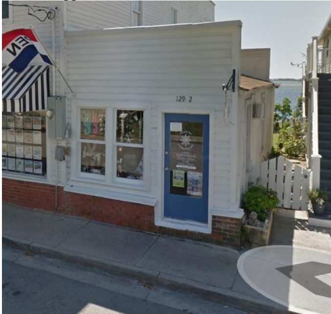
129 Front Street Unit 2