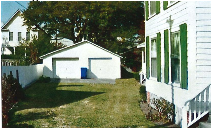
106 S Walnut Street