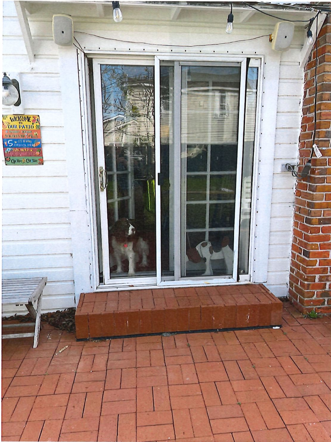
Existing door to be replaced