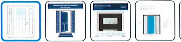
Replacement door- Fiberglass full light door with sidelights