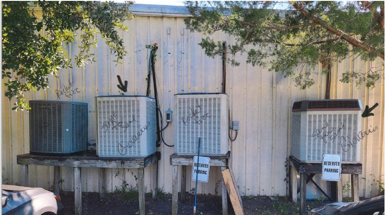
101 Church Street

Date: January 8, 2024 Applicant: Melissa Anderson Address: 101 Church Street Action: Install new HVAC units. Status: Approved