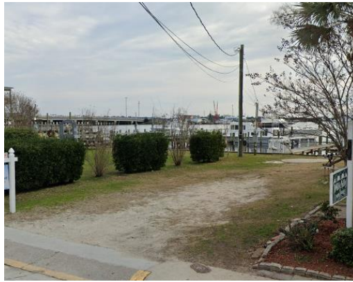
119 Water Street