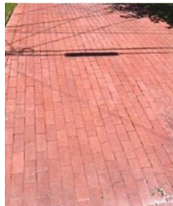
206 Walnut Street