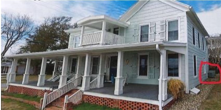
228 Elm Street