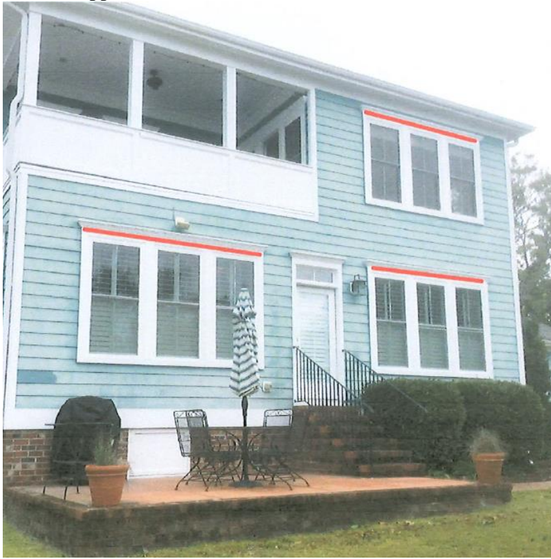
219 Walnut Street