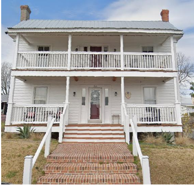
206 Elm Street