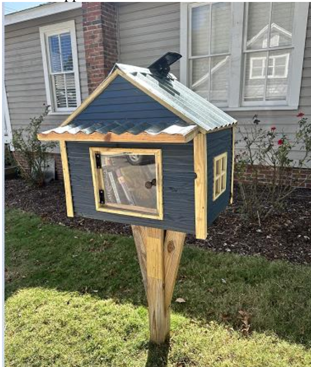
203 Church Street