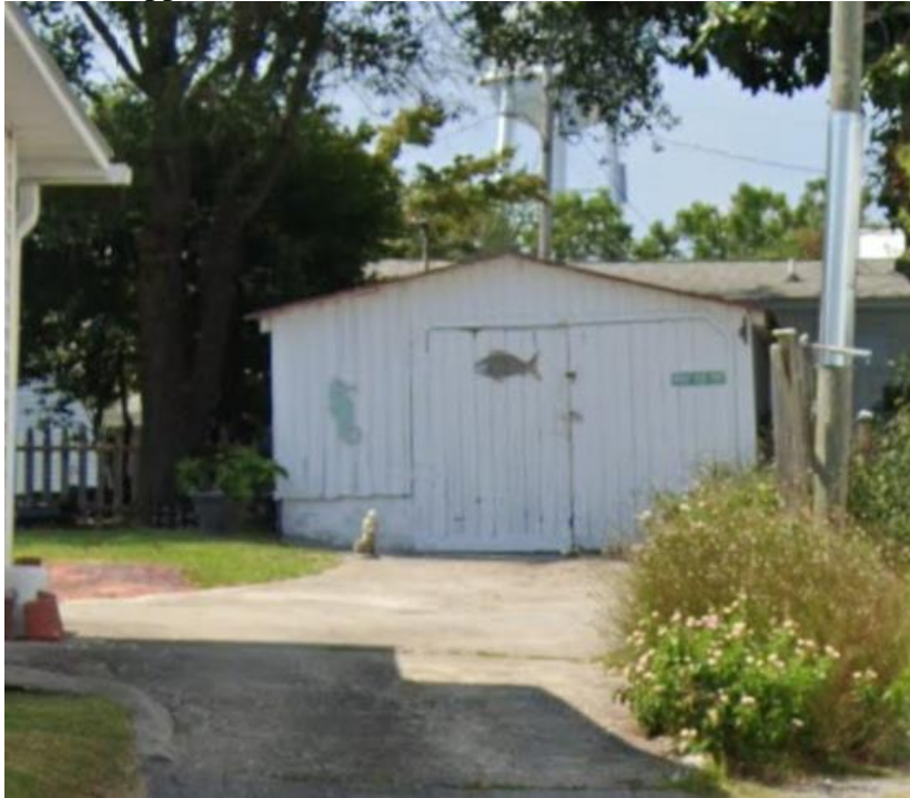
212 S Elm Street