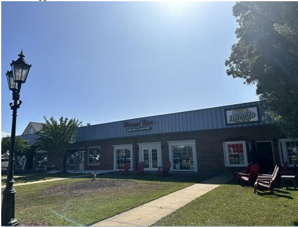
101 Church Street