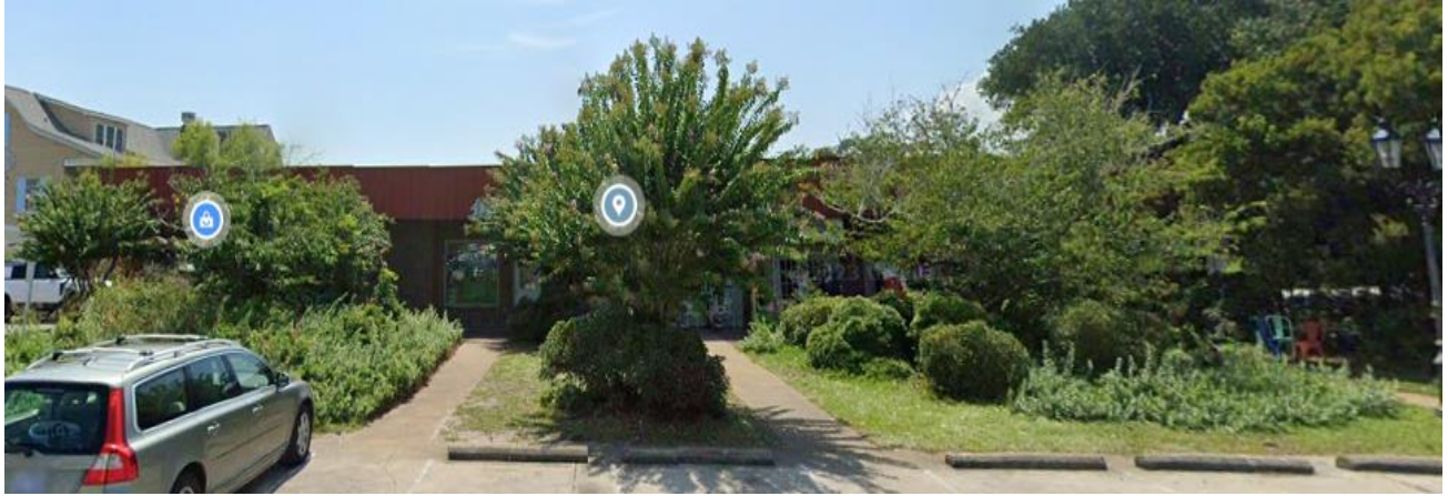
101 Church Street