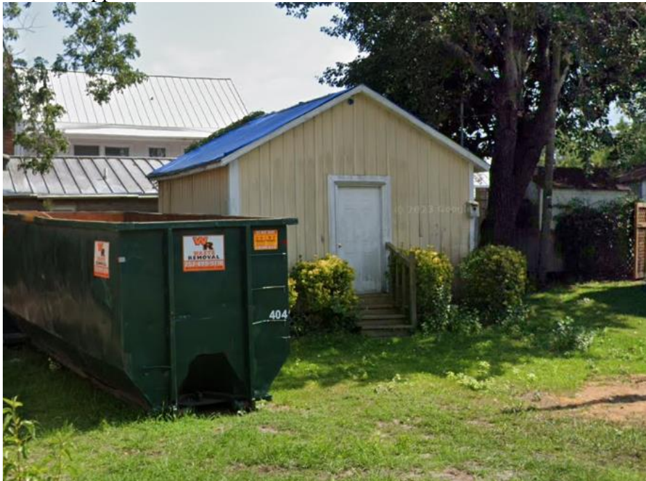
205 S Walnut Street