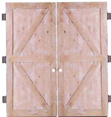
209 Water Street