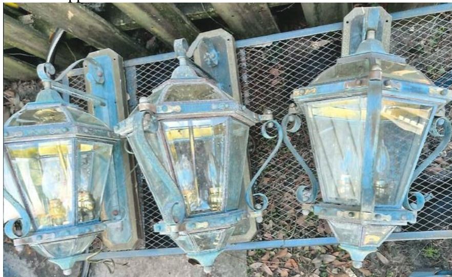
224 Water Street