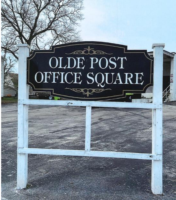
208 Main Street