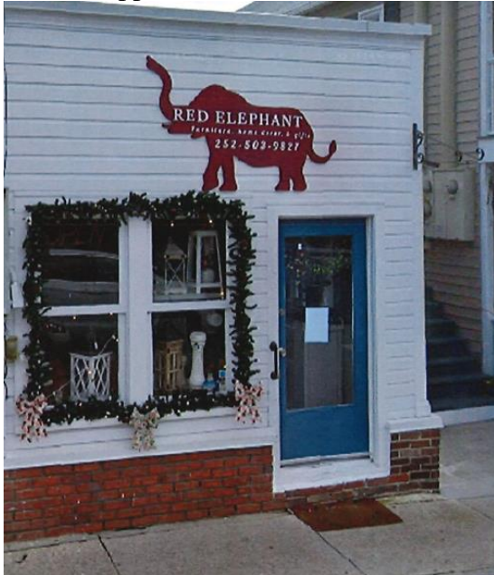
127 Front Street