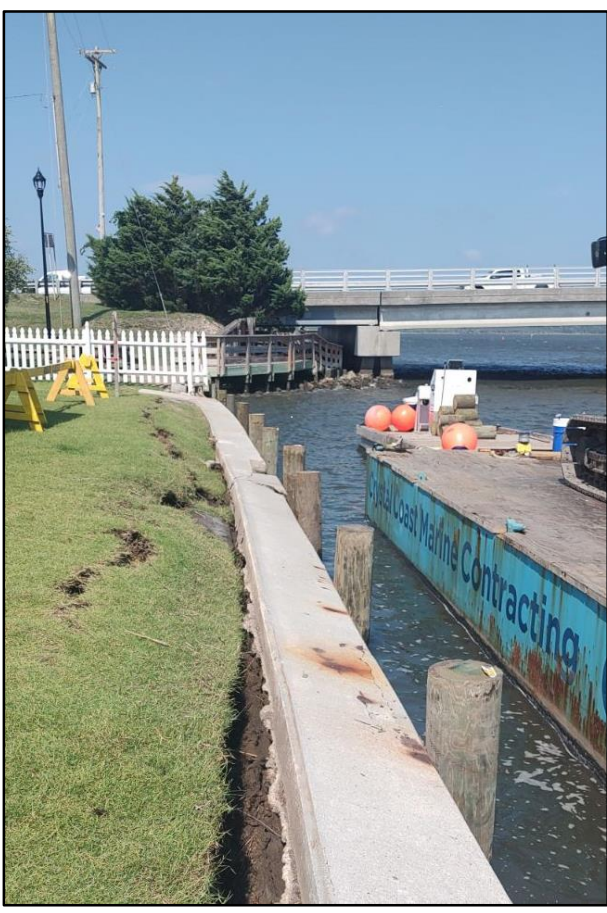
11 pilings added to temporarily hold bulkhead