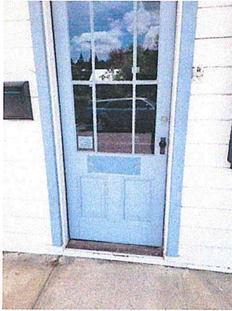
Office Door, Sign #1 will be placed below the window.