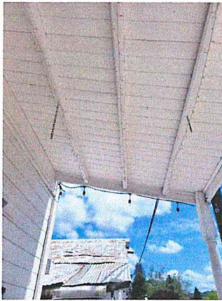
Existing Chains. Sign #2 will be hung from these.