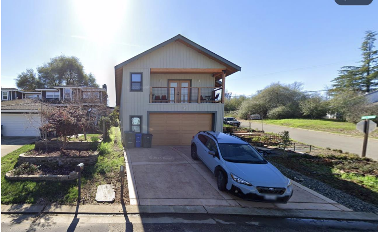
Street View- 30 Bryson Drive