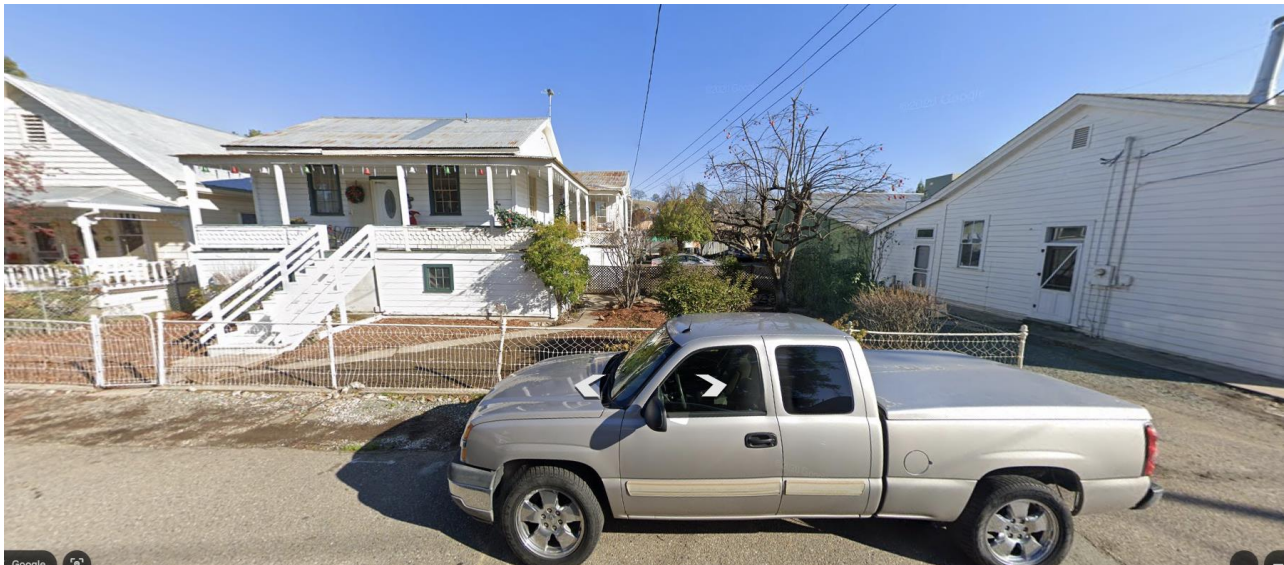
Figure 3: Street View