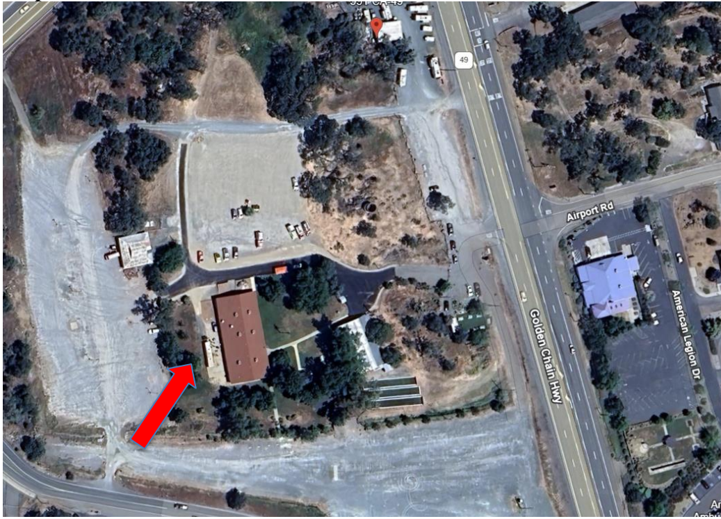
Map 1. Aerial Photo