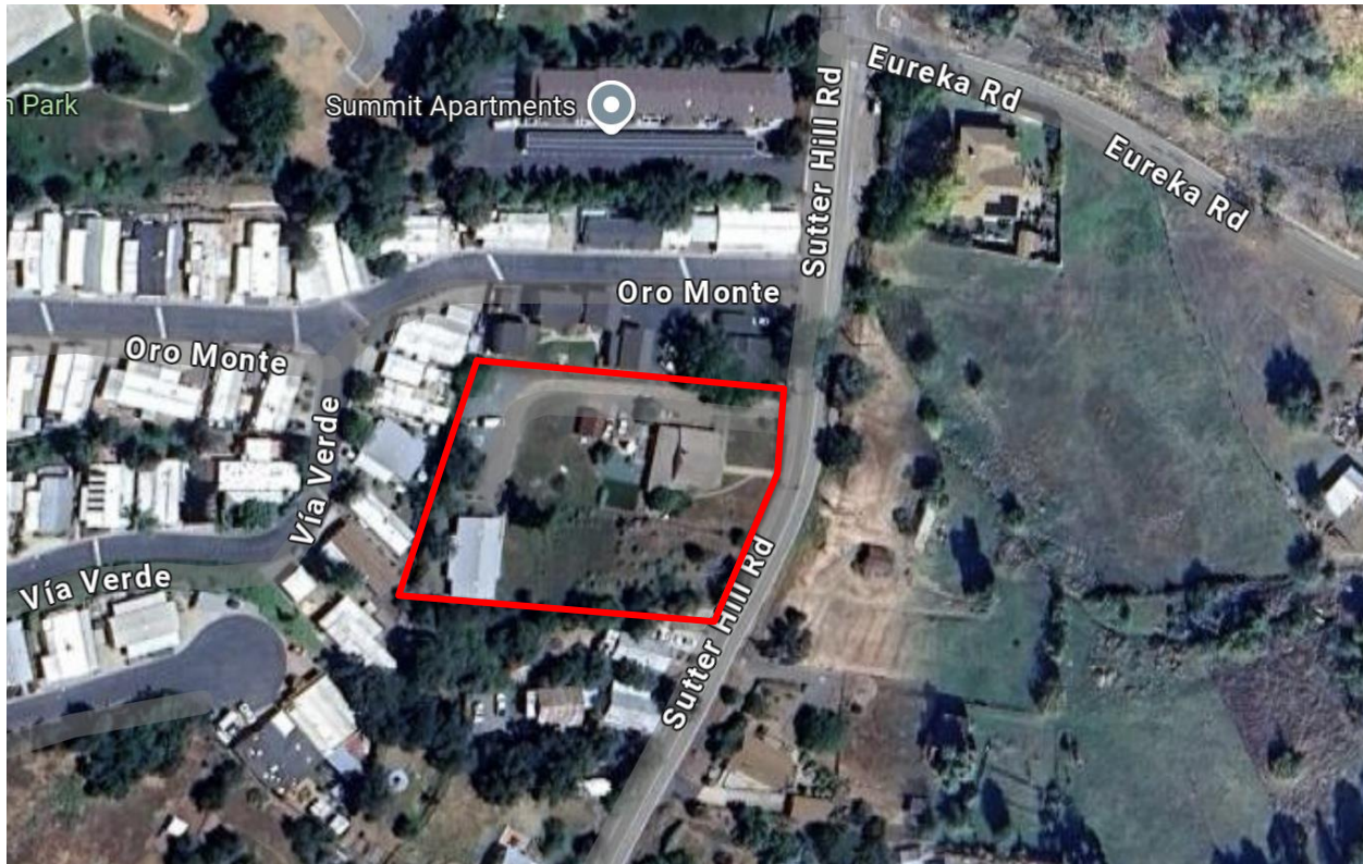
Figure 1: Parcel Location Map (approximate property lines)