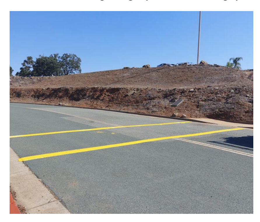
Independence Drive Crosswalks