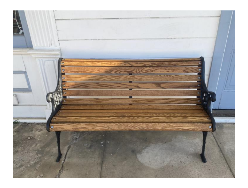
Monteverde Bench Restoration