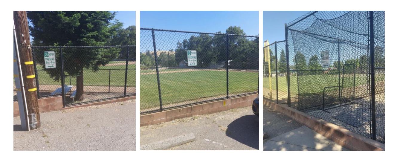
Cribbs Field Parking Lot signs (Left, Center, and Right)