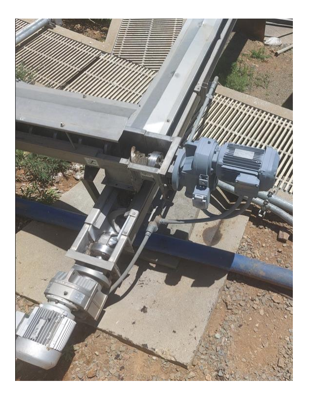
New Gear box for Headworks Auger