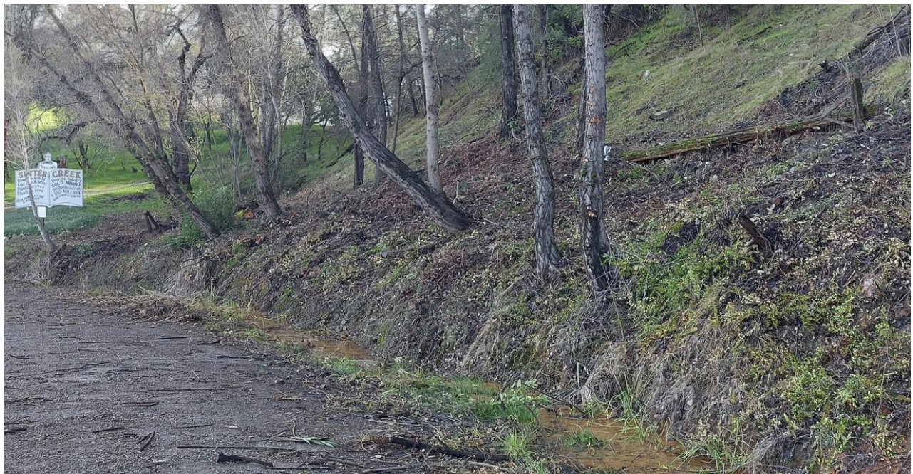
Old Hwy 49 clearing between the Book and Old Sutter Hill Rd