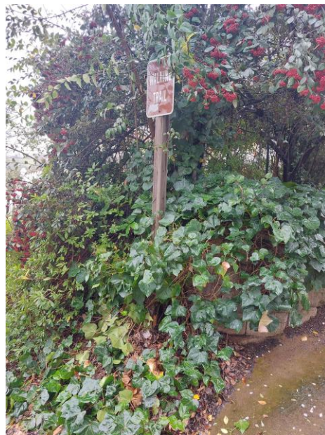
Walking Sign after fixing