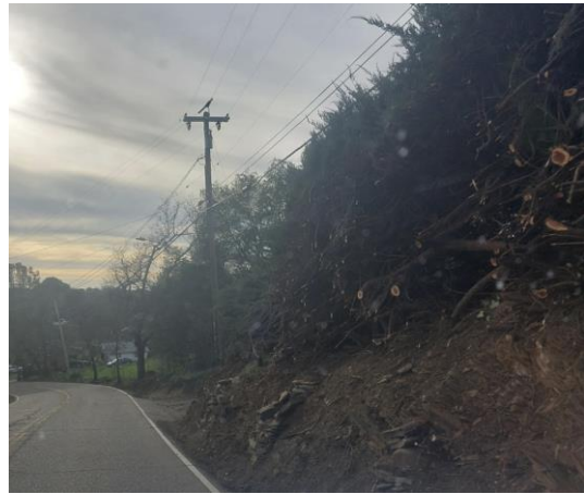
Gopher Flat hedge before and after clearing.