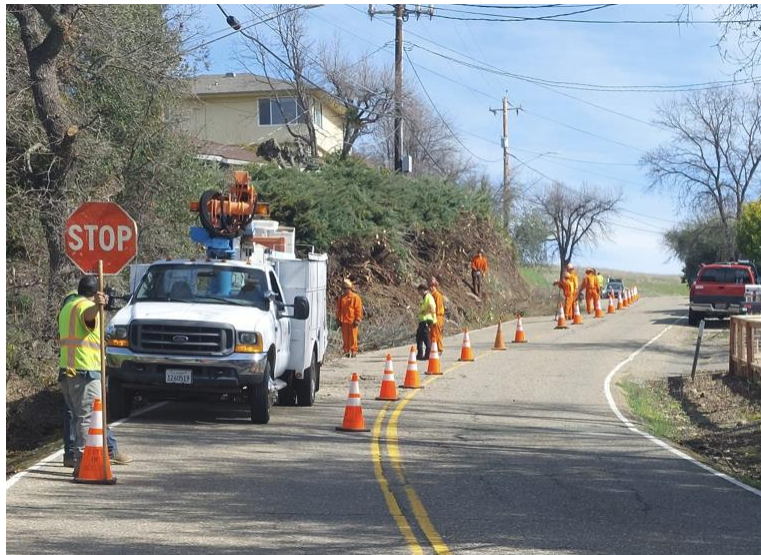
Gopher Flat Crew and Public Works clearing