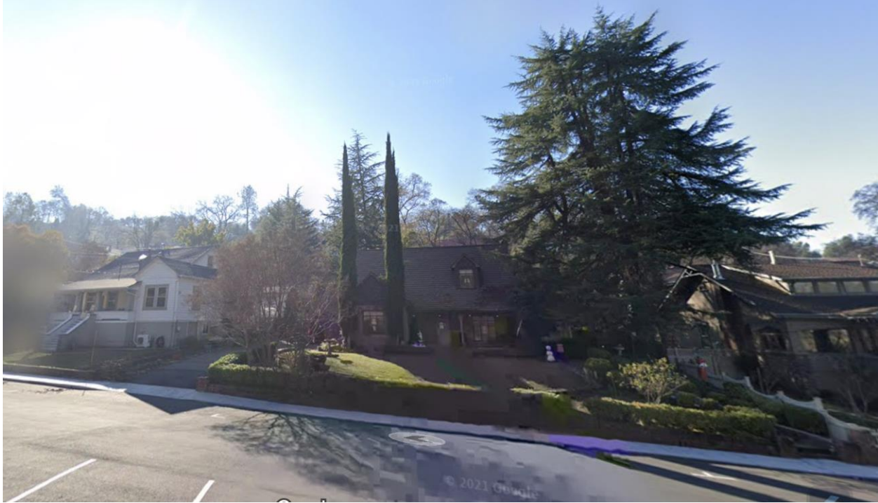
Street View- 23 Main Street