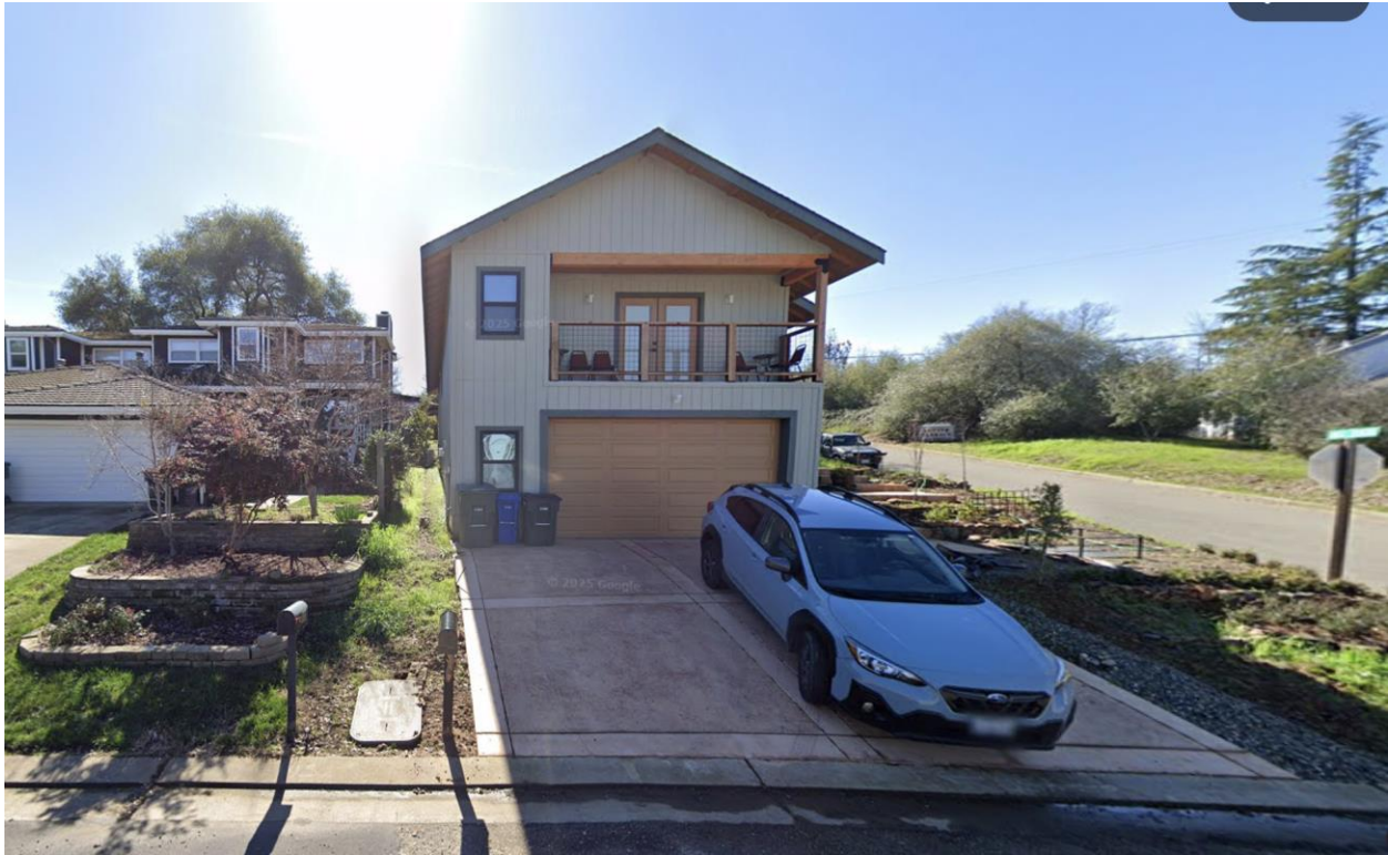
Street View- 30 Bryson Drive