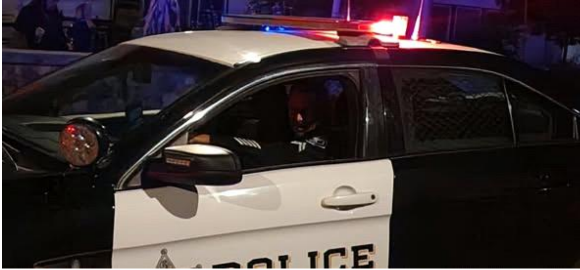
On Halloween, SCPD and City staff welcomed awesome visitors from school!