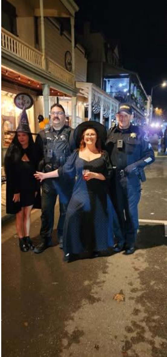
On October 29, SCPD participated in the Amador HS Big Game Rally!