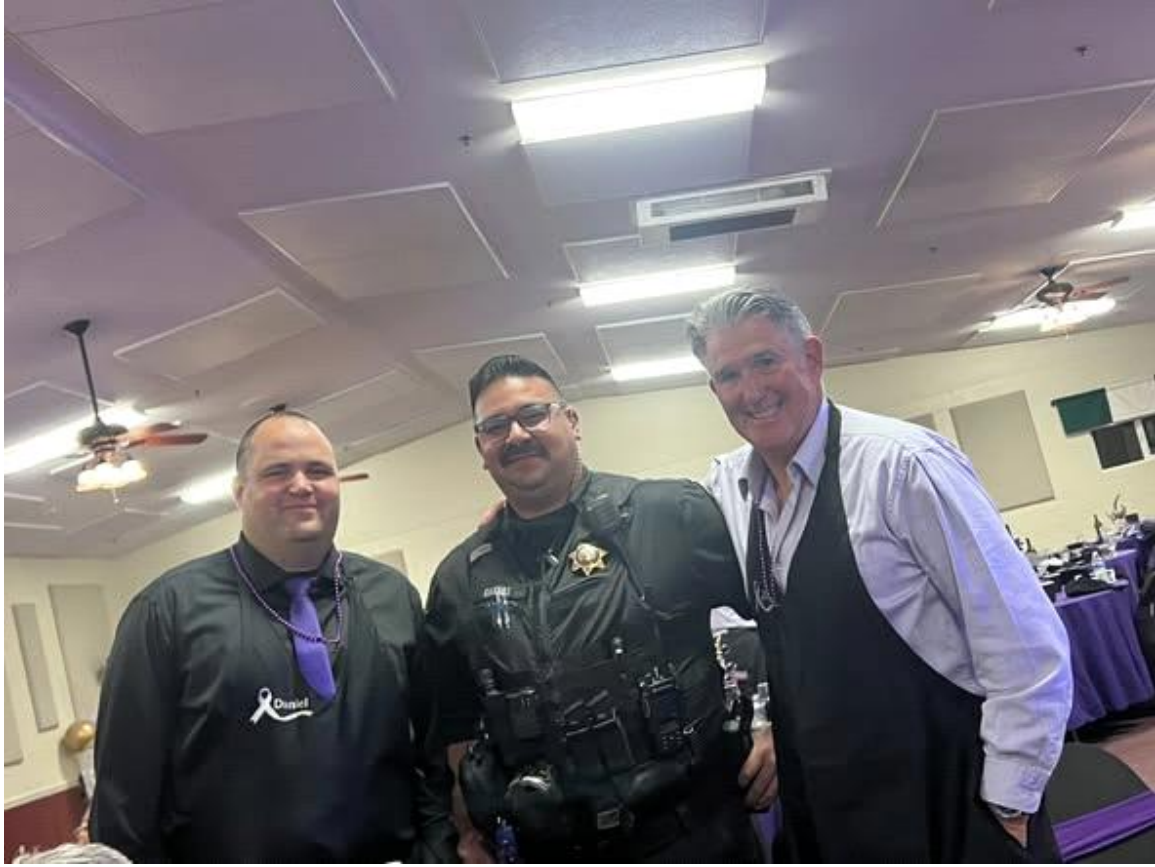
On October 25, SCPD participated in the Sutter Creek Witches Walk.