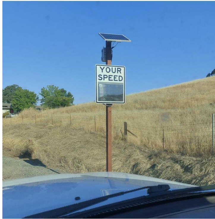
Gopher Flat Radar Sign