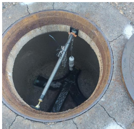
Flow Meter Installation-Complete