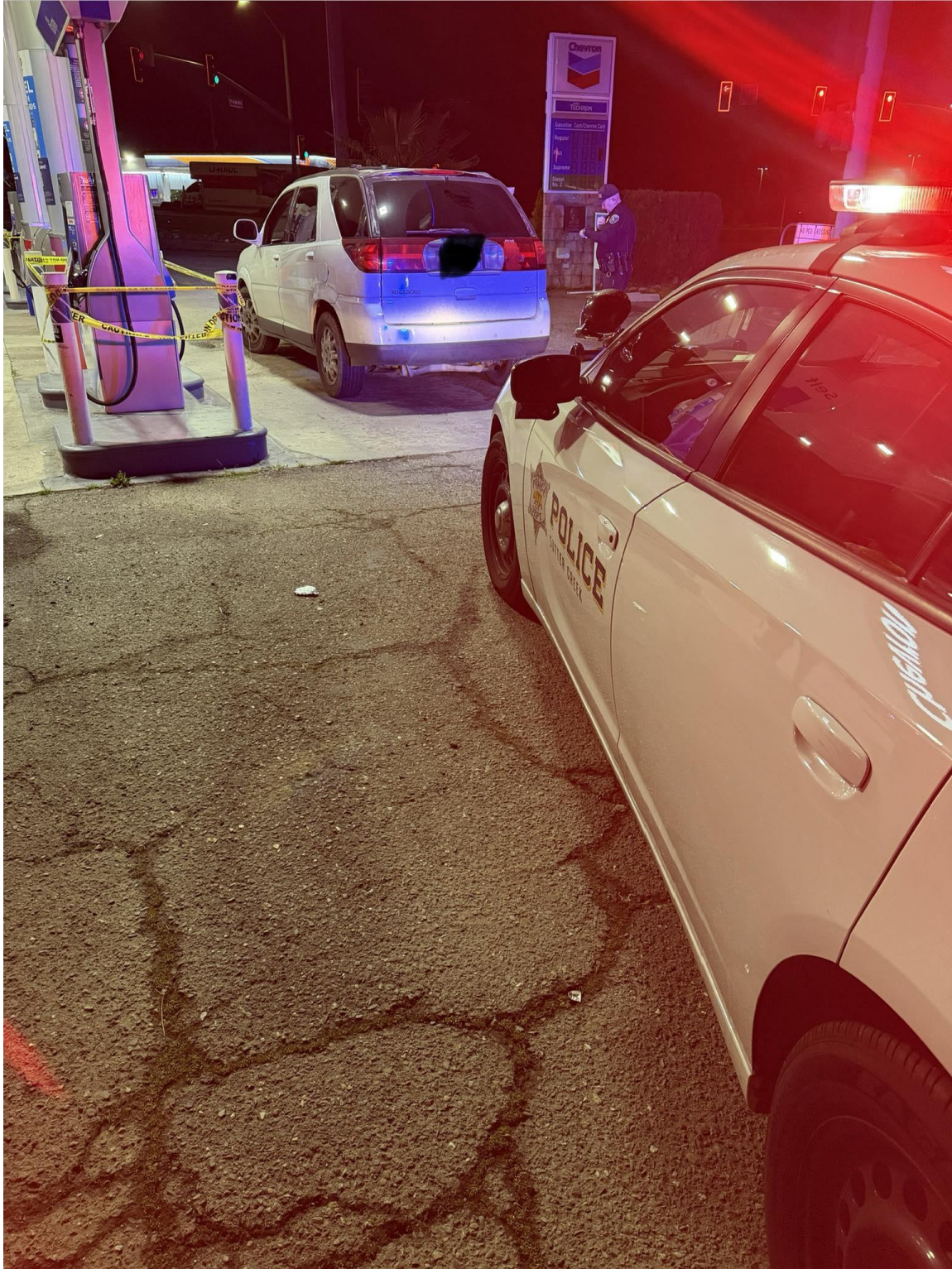
On January 29, At almost 3 in the morning yesterday, SCPD conducted a traffic stop on a silver Nissan Sentra for expired registration. During the stop, the driver and all of the occupants were determined to be unseatbelted, to include a woman seated on the floor.