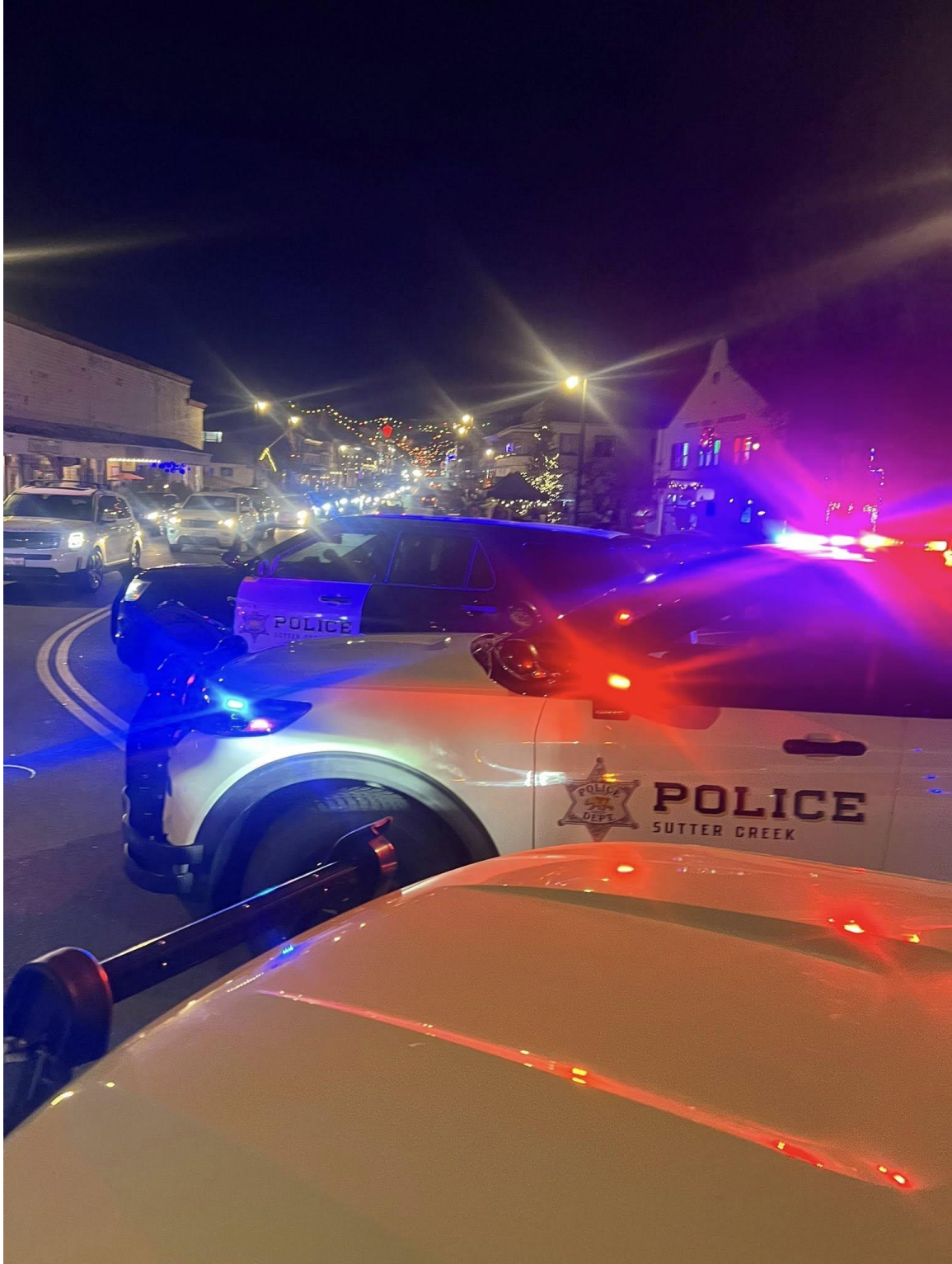
On October 29, SCPD participated in the Amador HS Big Game Rally!