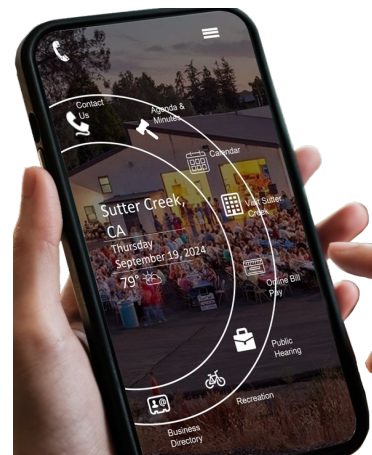
Mock-up of Sutter Creek's My Civic app Homepage