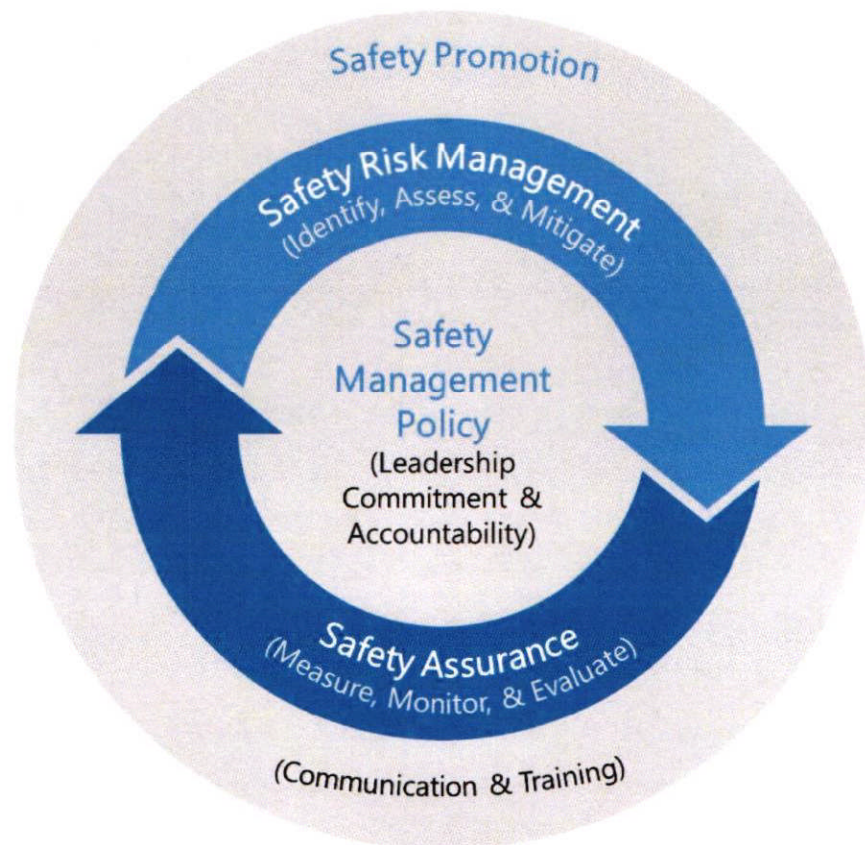
Figure 3: Safety Management Systems

SMS is comprised of four basic components: SMP, SRM, SA, and SP. The SMP and SP are the enablers that provide structure and supporting activities that make SRM and SA possible and sustainable. The SRM and SA are the processes and activities for effectively managing safety as presented in Figure 3.