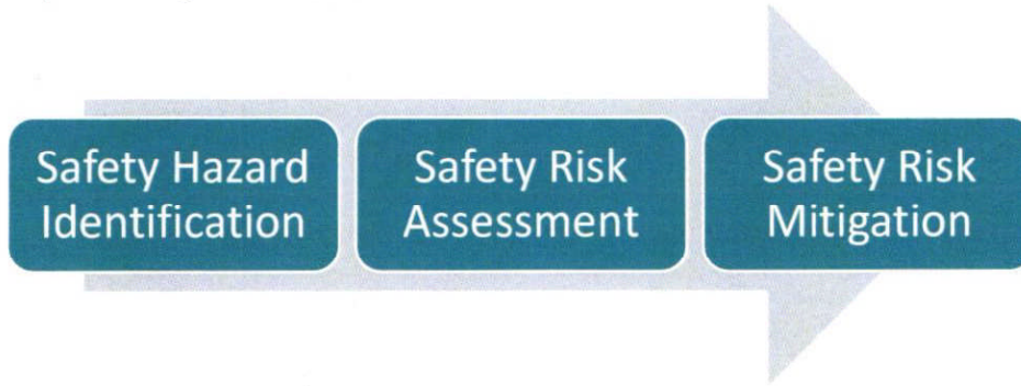
Figure 4: Safety Risk Management Process

The implementation of the SRM component of the SMS will be carried out over the course of the next year. The SRM components will be implemented through a program of improvement during which the SRM processes will be implemented, reviewed, evaluated, and revised as necessary, to ensure the processes are achieving the intended safety objectives as the processes are fully incorporated into STAR Transit’s SOPs.