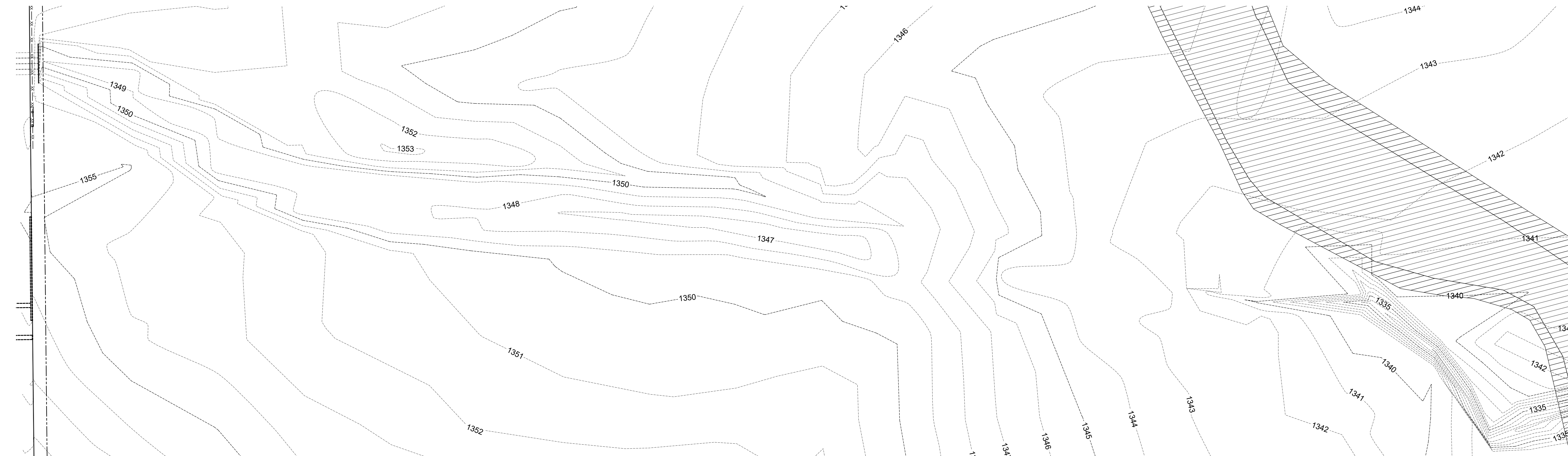
A1 PRE-DEVELOPMENT CHANNEL 1" = 50'

Stephenville ISD Stadium Honeybees & Yellowjackets