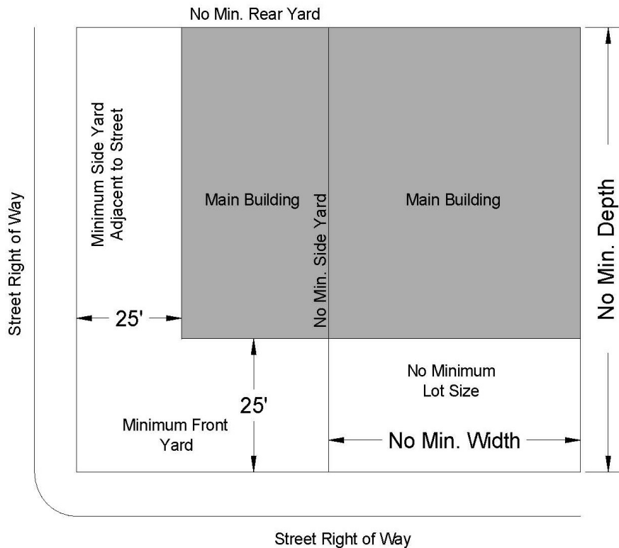
Height, Area, Yard and Lot Coverage Requirements

Note: No rear or side yard except when the lot abuts upon a Residential District, then the minimum setback is 25 feet.