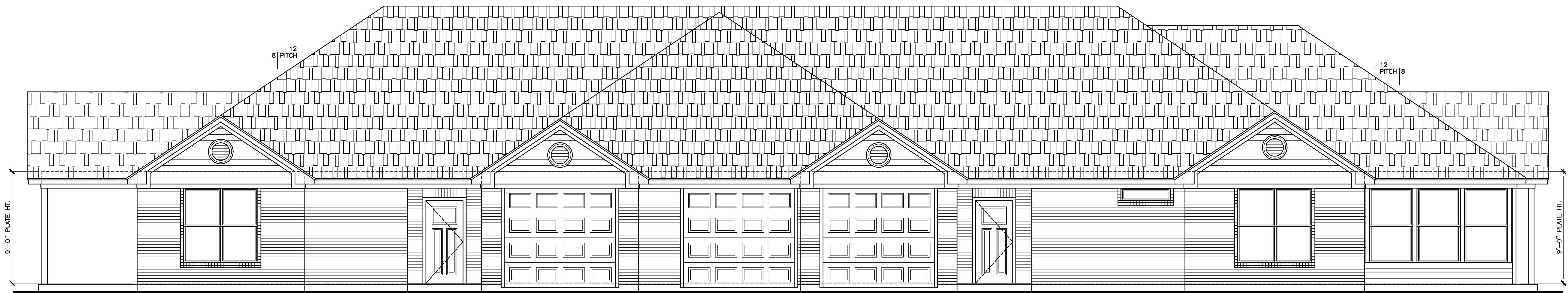
FRONT ELEVATION 'C' SCALE: 1/4"=1'-0"

A DUPLEX DEVELOPMENT DESIGNED FOR STEVE PEACOCK STEPHENVILLE, TEXAS ARCHITECT JOHN G. BEVERLY P.O. BOX 1990 STEPHENVILLE, TEXAS 76401 ARCHITECT JOHN G. BEVERLY P.O. BOX 1990 STEPHENVILLE, TEXAS 76401 (254) 396-9999 M. john@jgarch.com