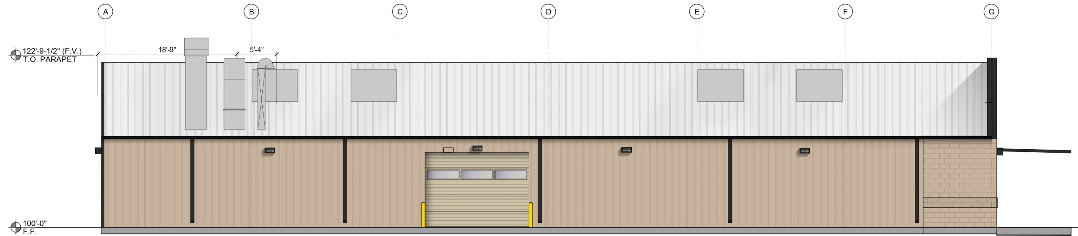
03 LEFT ELEVATION SCALE: 1/8" = 1'-0"