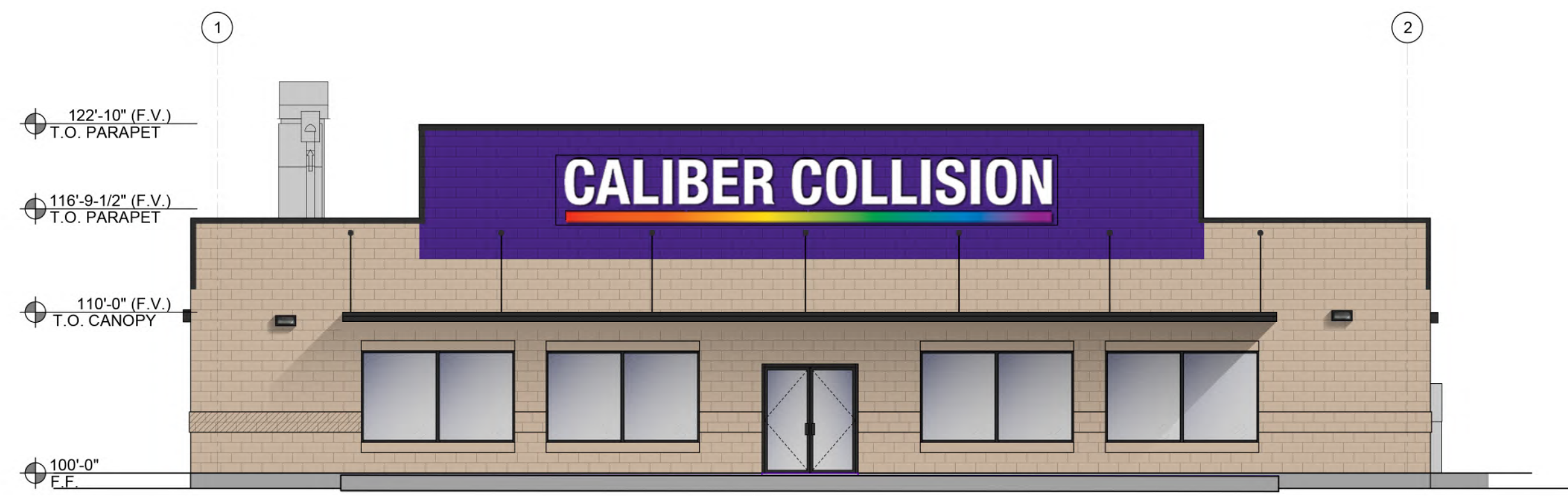
01 FRONT ELEVATION SCALE: 1/8" = 1'-0"