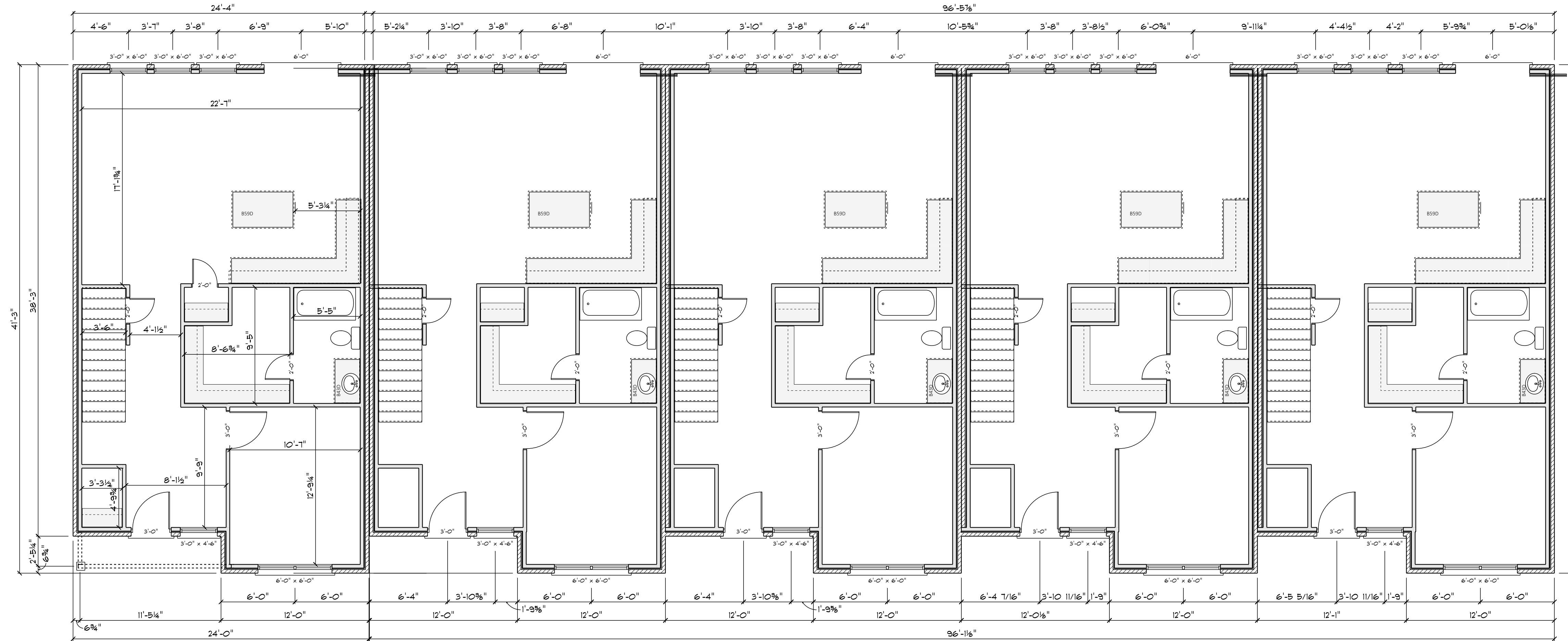
MAIN FLOOR SCALE: 3/16" = 1'-0"