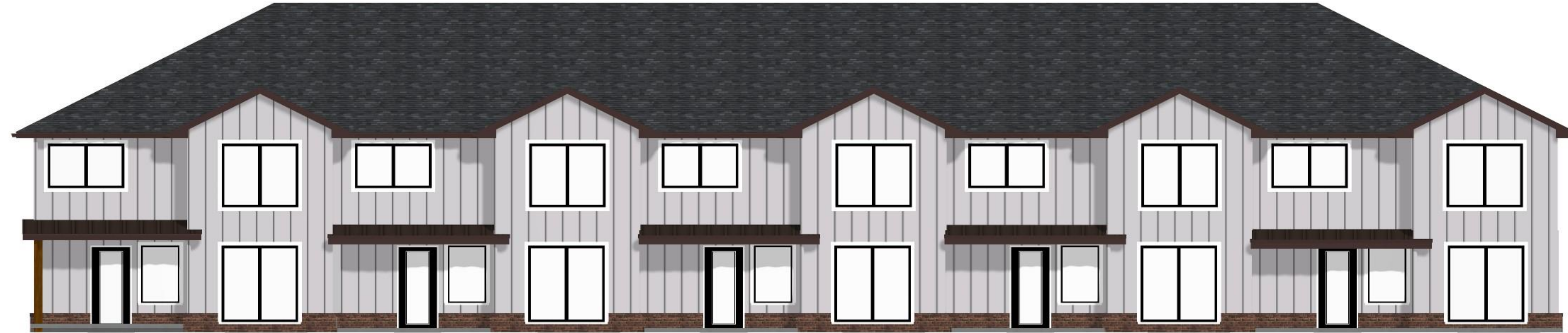
FRONT ELEVATION SCALE: 3/16" = 1'-0"