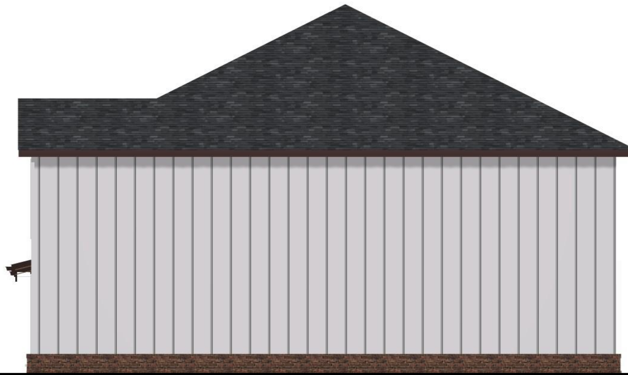
RIGHT ELEVATION SCALE: 1/4" = 1'-0"