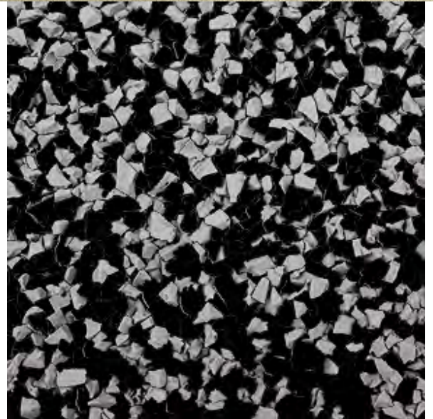
50% Gray/50% Black