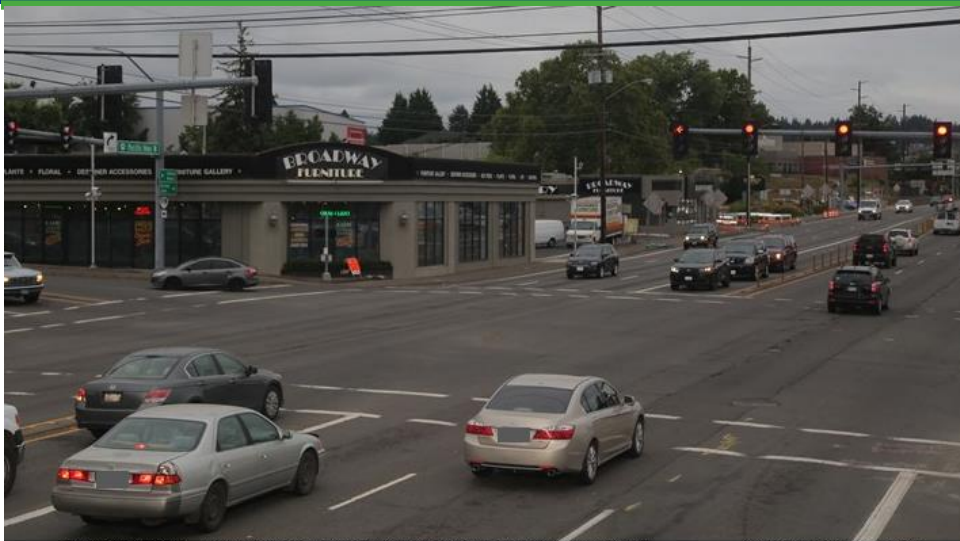
2023-07-10 06:38:35.1 Location: 6001[SW Pacific Hwy (99W) NB @ Hall Blvd -Posted Speed: 35MPH] Event Type: Red Light Violation Event 26592 Rear Image 1/2 Lane: 3 Speed: 40 MPH Time Into Phase: 0.6S Amber Time: 4.0 S