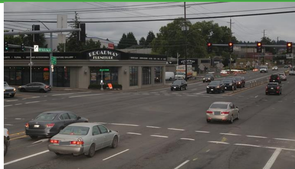
2023-07-10 06:38:35.8 Location: 6001[SW Pacific Hwy (99W) NB @ Hall Blvd -Posted Speed: 35MPH] Event Type: Red Light Violation Event 26592 Rear Image 2/2 [+0.6S] Lane: 3 Speed: 40 MPH Time Into Phase: 1.2S Amber Time: 4.0 S