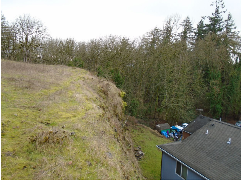
Middle: This photo taken from the south side of the bluff more-or-less within the right-of-way proposed to be vacated looking east.