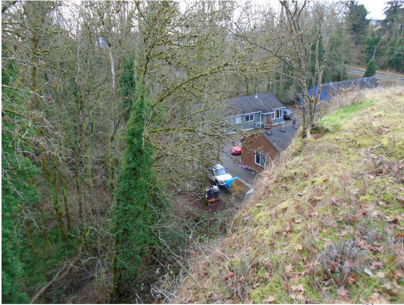
Top: This photo taken from the south side of the bluff more-or-less within the right-of-way proposed to be vacated looking west. N. 12 th Street is visible in the background.