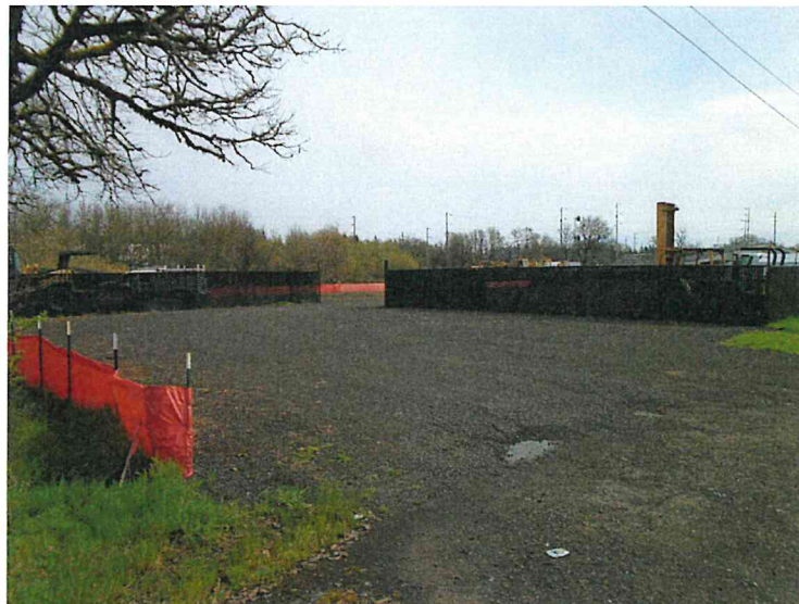
Photo taken March 29, 2024 looking northeast at the subject property from Gable Road.

The reason for the annexation in this case is to use the City's land use rules. To use the site as a storage yard, the City's normal process is administrative, whereas the County processes includes a public hearing before its Planning Commission given the size of the site. The County's process is not desired by the applicant. So, the intent is to annex and use the city's land use rules to grant the use and remedy this enforcement issue.