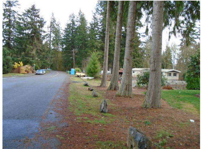
Left: 35046 Maple Street single family dwelling. Fir trees along the northern property line pictured. Right: Maple Street frontage abutting the property, looking west.