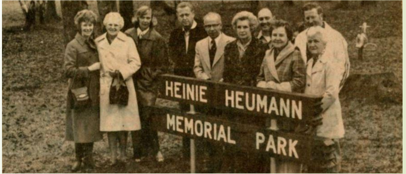
HEINIE HEUMANN PARK