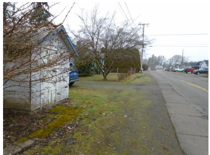
Left: 58927 Firlok Park Street single-family dwelling. Two accessory structures pictured in background. Right: Firlok Park Street right-of-way abutting subject property looking north