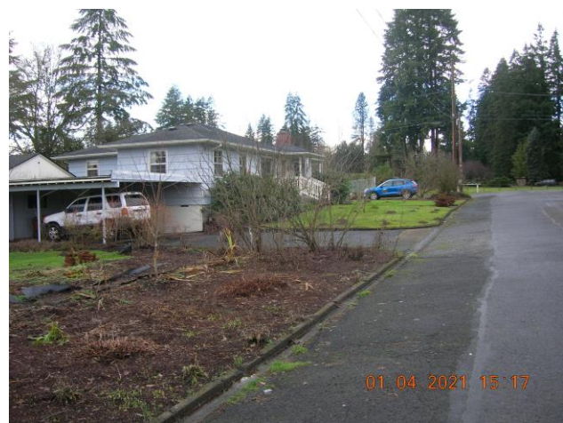
Subject property on left. Driveway approach shown with curb and gutter along Firway Lane.