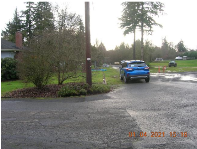
Subject property on left. Undeveloped Kavanaugh Street right-of-way pictured on right.

The subject property is developed with a detached single-family dwelling on a square-shaped, corner lot at 22,500 square feet or 0.52 acres. It is made of two lots from the Golf Club Addition Subdivision. It is accessed by Firway Lane with a paved driveway to a covered carport (pictured on right below). Firway Lane is a developed local classified street without sidewalks on either side, but it does have a curb and gutter along the abutting property. The subject property also abuts Kavanaugh Street right-of-way to the west, which is a gravel undeveloped right-of-way also lacking frontage improvements (although it does have a curb abutting the subject property). Both streets are within the County's jurisdiction. The dwelling is connected to McNulty water and not connected to City sewer, although City sewer is available in Firway Lane and Kavanaugh Street.