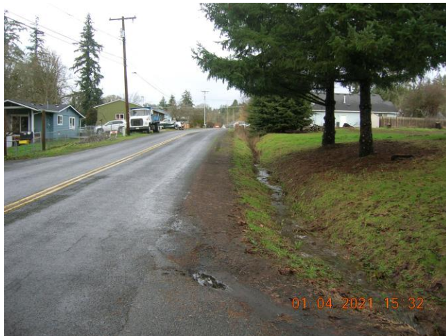
Looking north along Firlok Park Street. Subject property on right.

The subject property is a rectangular shaped lot at 20,473 square feet or 0.47 acres. It is located at the corner of Firlok Park Street (Firlock Boulevard) and Fir Street. It is currently vacant, but the applicant has received approval for a septic system for a detached single-family dwelling through the County. Firlok Park Street is a developed collector classified street without frontage improvements (sidewalks, curb, and landscape strip) on either side. Fir Street is a local street without any frontage improvements. Both roads are within the County's jurisdiction. The parcel is generally flat sloping towards the two streets with a few sparse trees around the perimeter. There is a stormwater ditch along Firlok Park Street and along the shared northern property line.