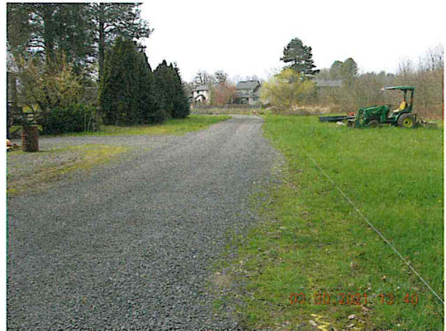
Six Dees Lane looking west towards the remainder of the property