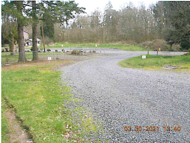
Six Dees Lane looking south towards Columbia Blvd.

A Building Permit (No. 749-15076) was approved to construct a new detached single-family dwelling on the portion of the lot which is already within City limits. As part of the development of the detached single-family dwelling (and connection to City utilities), the applicant is required to annex the remainder of the property into City limits.