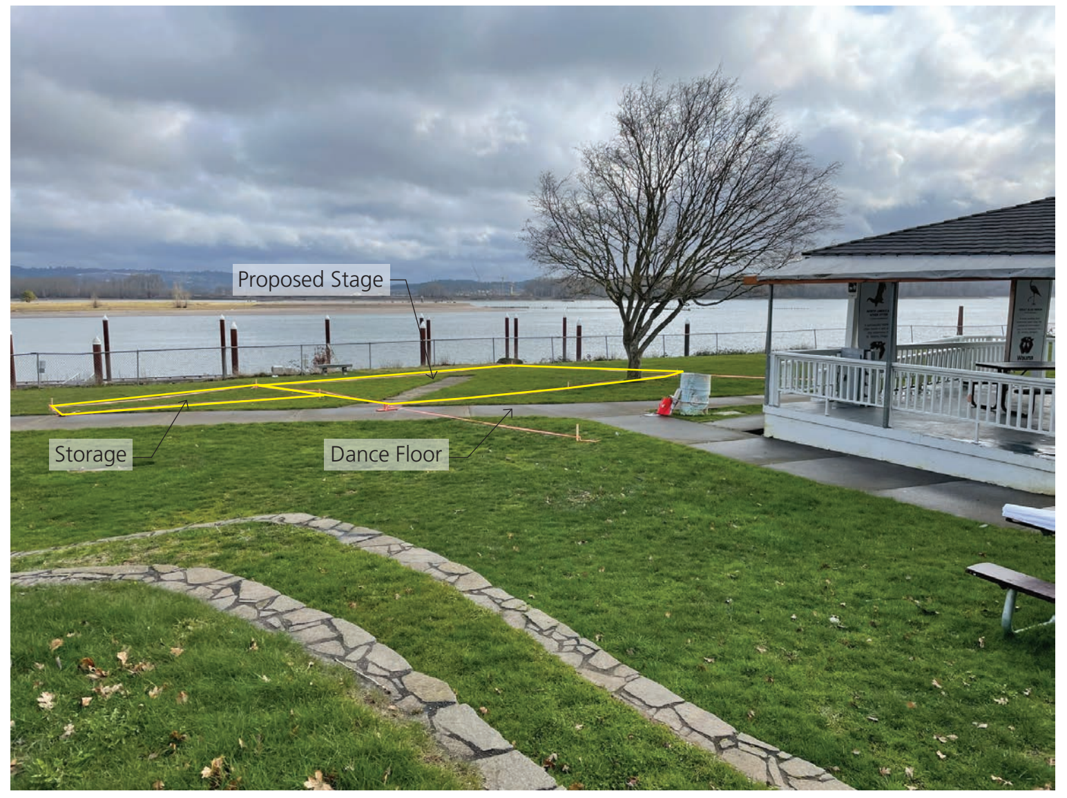
View looking southeast toward proposed stage from amphitheater seats