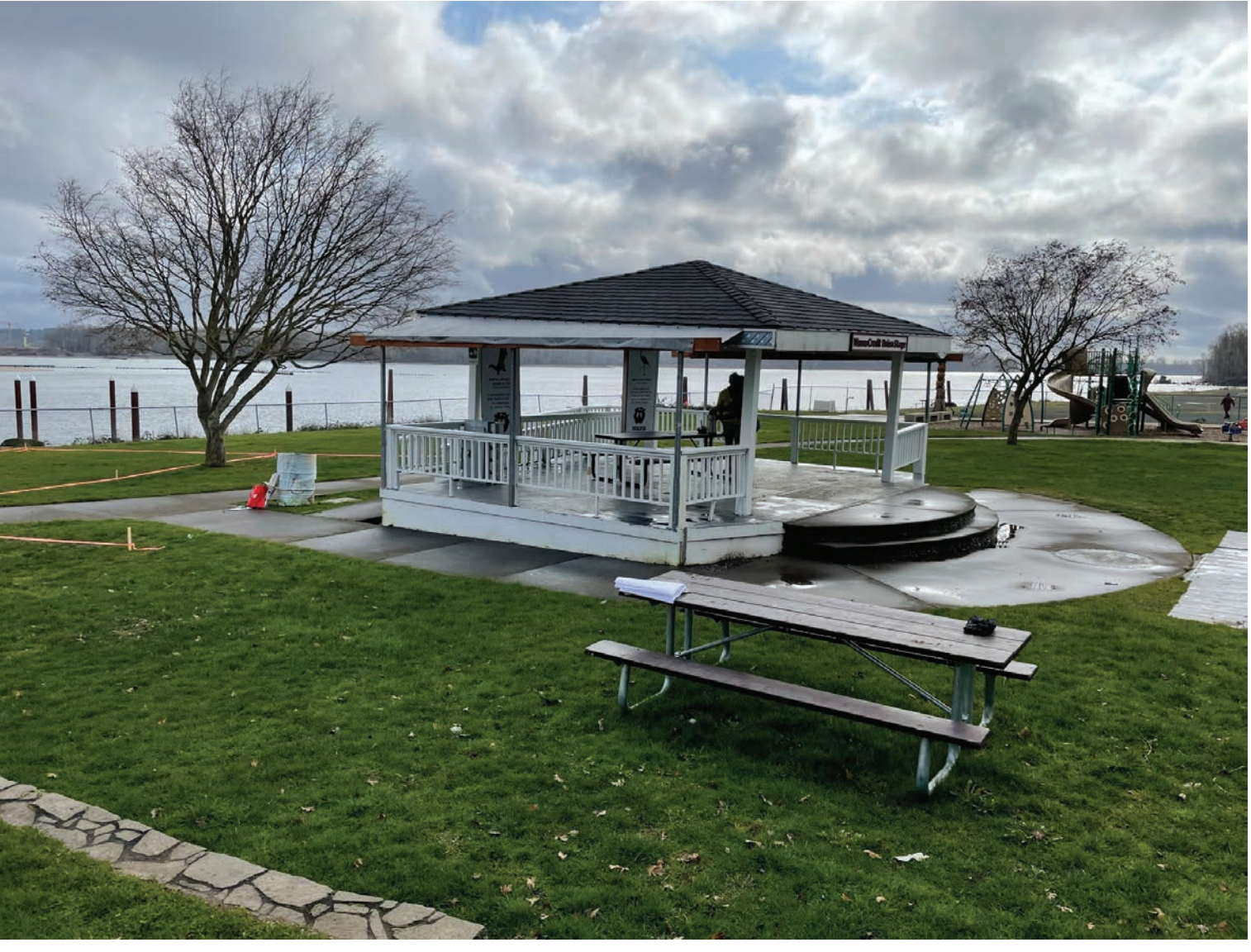
View looking southeast toward existing stage from amphitheater seats