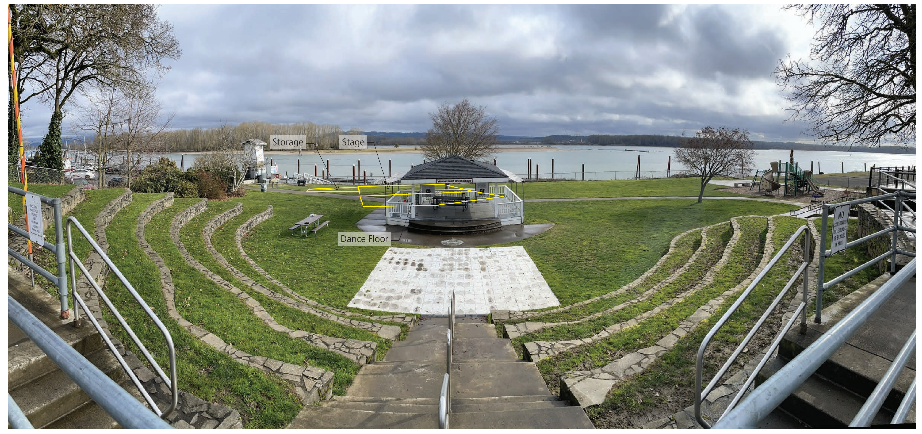
View looking east from top of amphitheater stairs