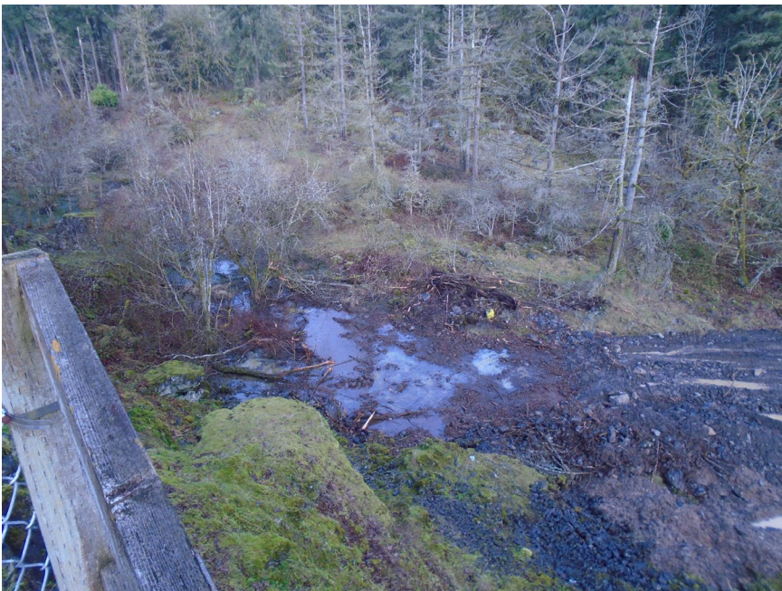
Below: Same area on January 24, 2023. You can see how fill material has been pulled back off of the city park property.