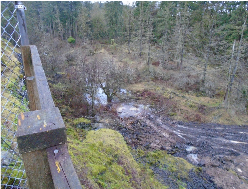
Above: SE corner of the Botanical Gardens property on Jan. 13, 2023.

A recently approved grade/fill permit moved beyond its approved boundary and onto the city's Columbia Botanical Gardens Park property. Property owner remedied the situation, though some impact is still evident, but just on the perimeter of the park.