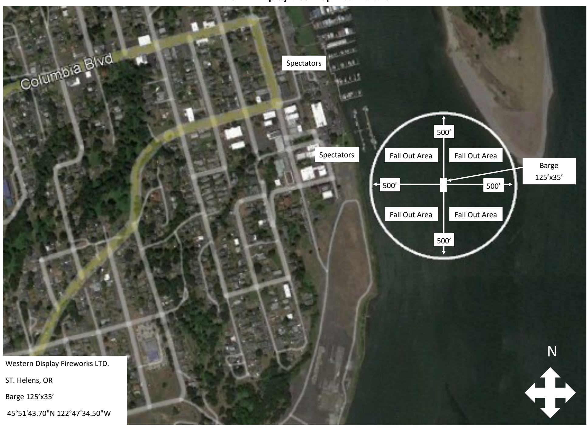
Exhibit A—Display Site Map—St. Helens